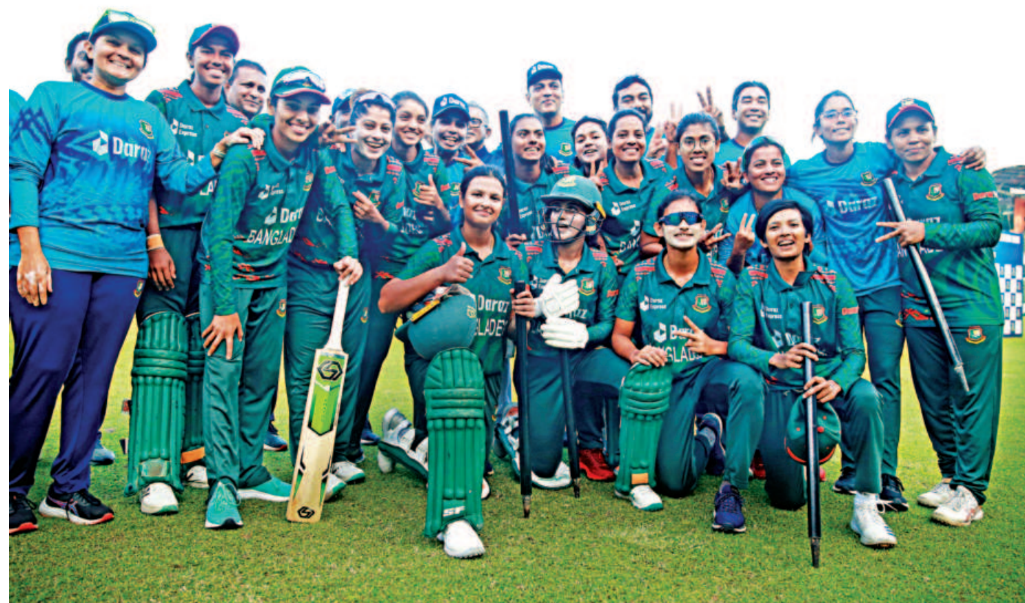
Bangladesh players pose for a photograph as they celebrate their seven-wicket victory, which helped them to a 2-1 series win, following the third Women's ODI against Pakistan at the Sher-e-Bangla National Cricket Stadium in Mirpur yesterday.