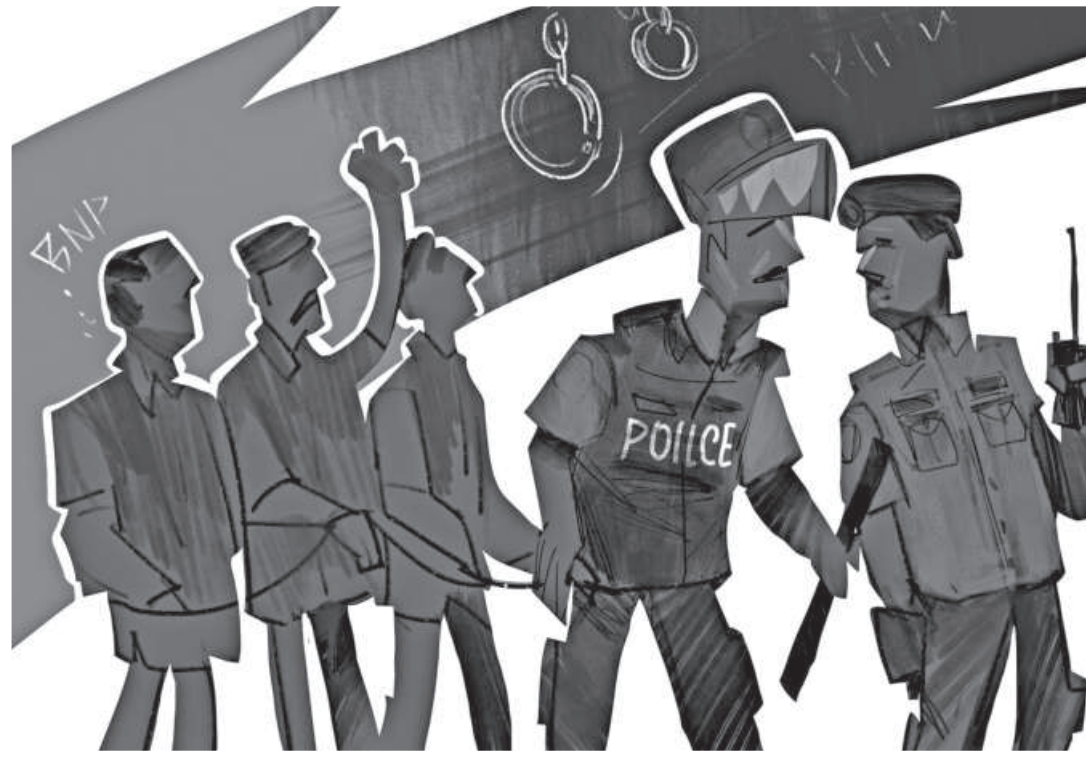
ILLUSTRATION: BIPLOB CHAKROBORTY

Politics in Bangladesh is at a crossroads right now. Following the violence that started unfolding at BNP's rally on October 28, the government has so far arrested over 2,000 BNP activists under 89 cases filed with 32 police stations under the Dhaka Metropolitan Police (DMP), including Secretary General Mirza Fakhru Islam Alamgir and other top leaders. Over 9,000 activists have been arrested countrywide since the rally, and law enforcement agencies will reportedly intensify their clampdown even more in the days to come. Given the circumstances, The Daily Star asked civil society members about their views on the mass arrest and their implications for a free, fair and acceptable general election in January 2024.