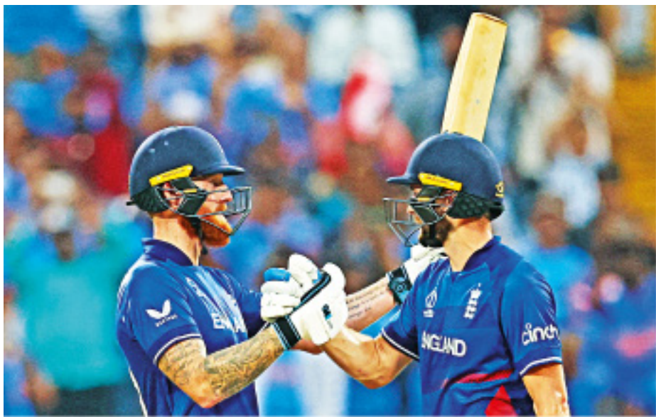
Ben Stokes (108) and Chris Woakes (51) shake hands during their 129-run seventh-wicket partnership, which helped England to a 160-run victory over the Netherlands in their World Cup game at the Maharashtra Cricket Association Stadium in Pune yesterday.