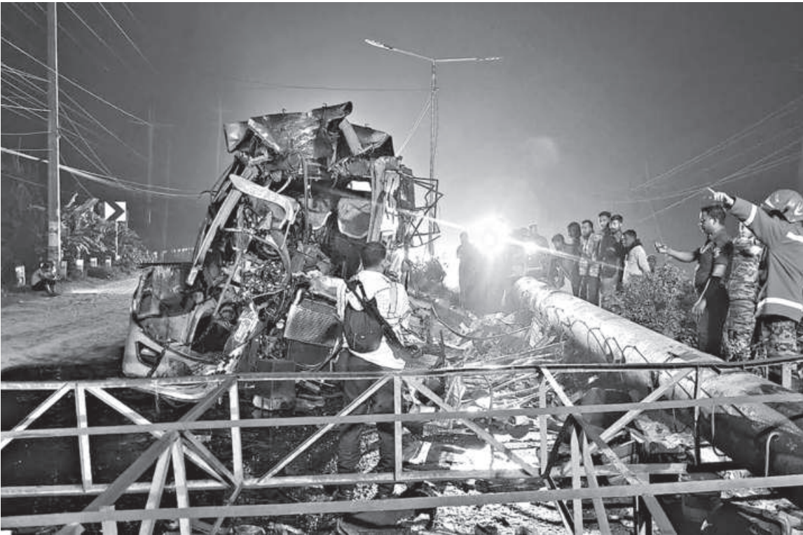
Firefighters in action after a bus and a pickup truck collided head-on in Shikarikanda area of Mymensingh yesterday.