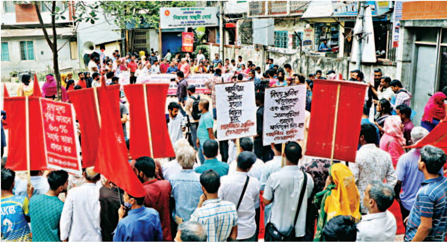
Workers chant slogans in front of the Minimum Wage Board Office in the capital's Segunbagicha yesterday, pressing home their demand for Tk 23,000 as minimum wage while a meeting of the wage board was underway. Meanwhile, the government yesterday announced Tk 12,500 as minimum wage for apparel workers.