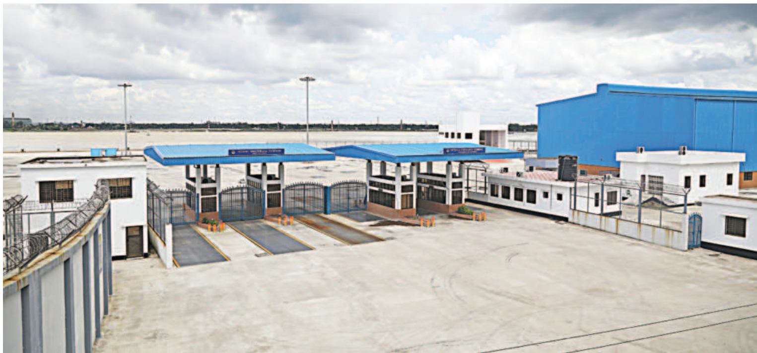
The entrance of Patenga Container Terminal near the Karnaphuli estuary. Situated on over 32 acres of land with three jetties of a total length of 600 meters, the terminal has the capacity to handle five lakh TEUs (twenty-foot equivalent units) of containers annually.