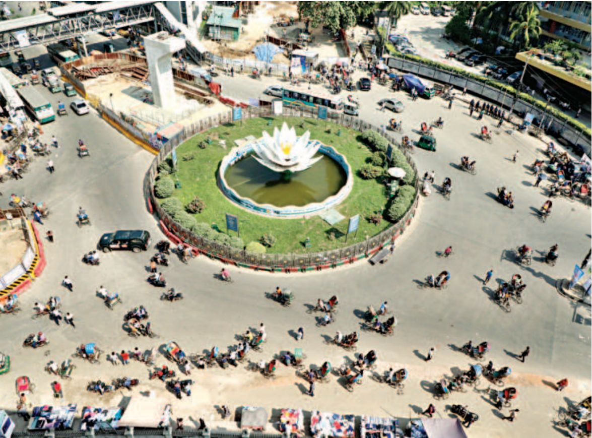
A few cars and other vehicles were seen around Motijheel's Shapla Chattar, a city spot that is usually crowded with buses, amid the country-wide blockade yesterday.

Prime Minister Sheikh Hasina, also the Awami League president, will officially kick off the party's campaigning for the upcoming national election through a rally in Sylhet, the party's General Secretary Obaidul Quader said yesterday. “Sheikh Hasina acknowledges the contribution of Sylhet's expatriates to the country's economy,” Quader said while visiting the party's office at Tejgaon in Dhaka. “For the development of Sylhet, the Awami League government has extensively constructed roads, bridges and culverts. People of Sylhet also love Sheikh Hasina,” he said. However, he didn't say exactly when the rally will take place. Referring to BNP, Quader said those who carry out arson attacks in the name of movement will inevitably fall. “BNP wants to oust the government in the name of blockade. Our leaders and workers should remain alert. Awami League will hold its peace and development rallies until the next elections. The country's people are eager to vote for Sheikh Hasina,” he said. Referring to the European Union's statement over the arrests of BNP leaders and activists, Quader said the EU is not well-informed. “They (EU) are our friendly countries and that is why we cannot condemn their statement. However, they have a lack of information... we do not want to quarrel with them. We don't want chaos in Bangladesh,” he said.