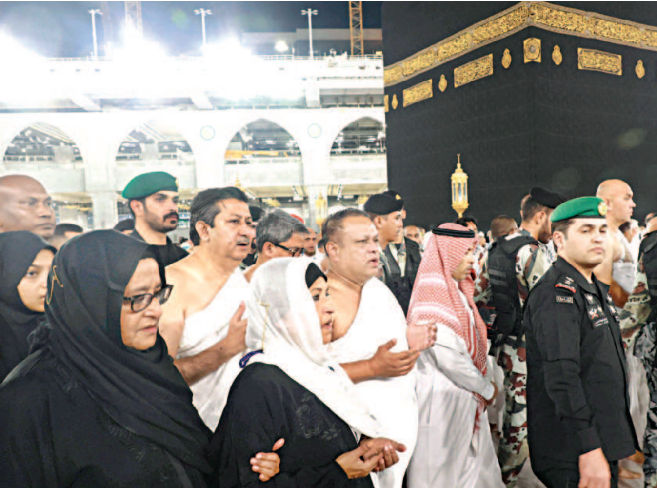
Prime Minister Sheikh Hasina and her sister Sheikh Rehana performing “tawaf” around the holy Kaaba Sharif. The premier performed Umrah and offered Salah at the holy mosque of Masjid Al Haram yesterday morning.

UNB, Makkah Prime Minister Sheikh Hasina performed Umrah in Makkah yesterday morning. The premier, along with her younger sister Sheikh Rehana, performed Umrah and offered Salah at the holy mosque of Masjid Al Haram. They prayed for the continued peace, prosperity and progress of the Muslim Ummah including Bangladesh and its people. Foreign Minister AK Abdul Momen, Prime Minister's Adviser on Private Industry and Investment Salman F Rahman, State Minister for Foreign Affairs Shahrar Alam and State Minister for Women and Children Fazilatunnesa Indira as well as other members of the entourage also performed Umrah. Later, Hasina offered Fajr prayers joining the congregation at Masjid Al Haram. Earlier, the PM left Madina by air and reach Jeddah from where she travelled to Makkah by road.