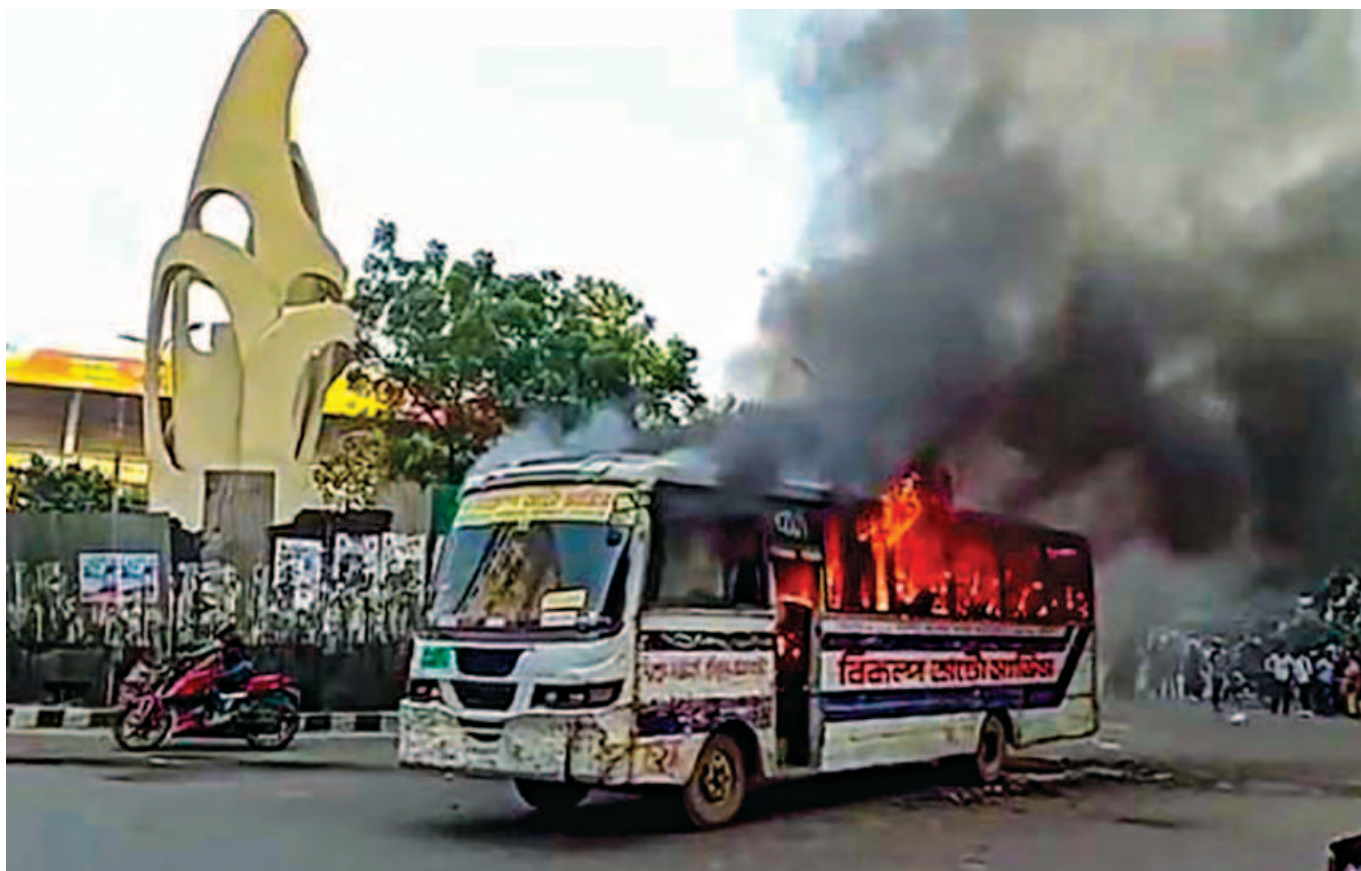
A city bus up in flames in the capital's Gulistan area yesterday -- the second day of the two-day blockade. The BNP has called another two-day blockade from tomorrow.