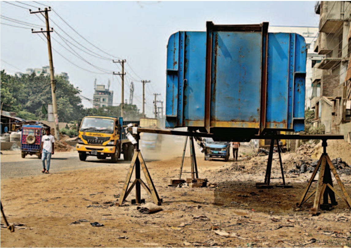
The container of a truck is kept on the side of a road in the capital's Postogola for repair works. As a result, people are forced to walk on the road amid traffic. The photo was taken yesterday.