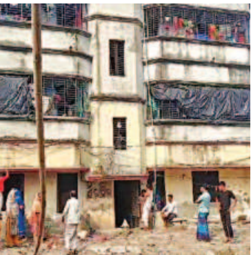
The building where the explosion took place.