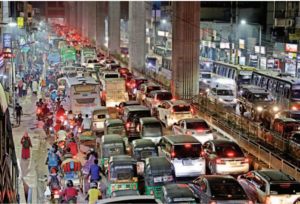
A long tailback was seen on the Kazi Nazrul Islam Avenue in the capital yesterday evening, ahead of the two-day countrywide blockade starting today.