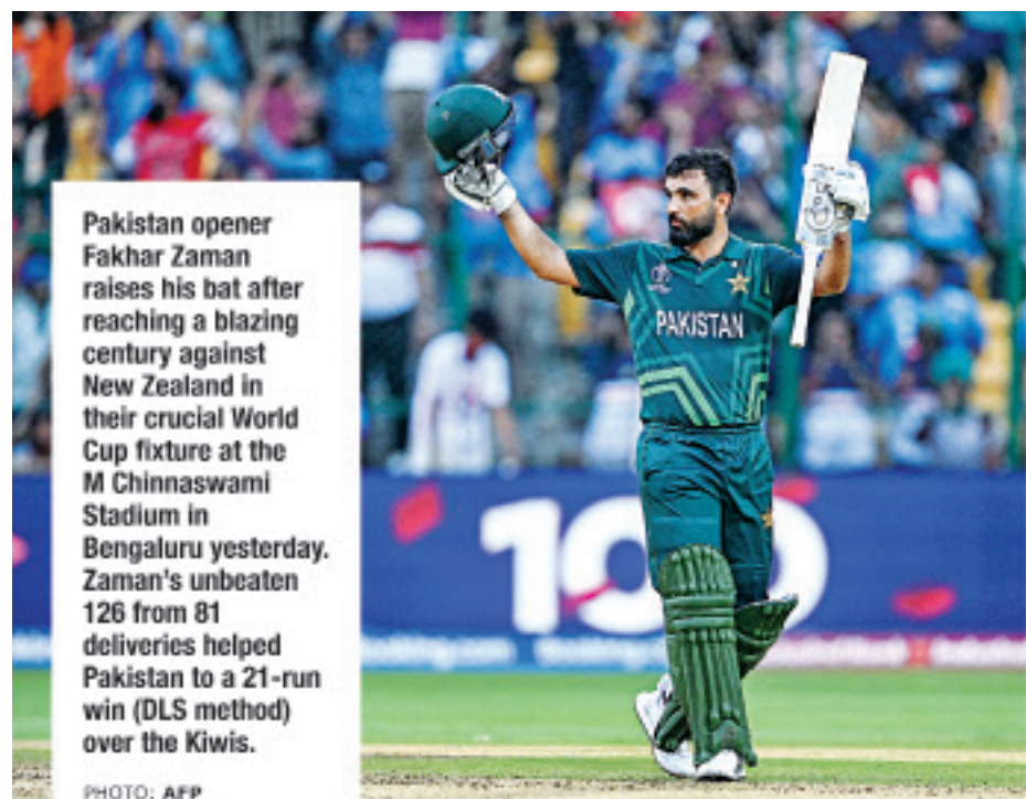
Pakistan opener Fakhar Zaman raises his bat after reaching a blazing century against New Zealand in their crucial World Cup fixture at the M Chinnaswami Stadium in Bengaluru yesterday. Zaman's unbeaten 126 from 81 deliveries helped Pakistan to a 21-run win (DLS method) over the Kiwis.