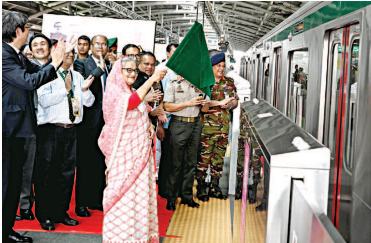
Prime Minister Sheikh Hasina flags off a train at the Agargaon metro station inaugurating the Agargaon-Motijheel section of the MRT Line-6 yesterday. From today, metro rail will be in limited operations from the Uttara North to Motijheel.