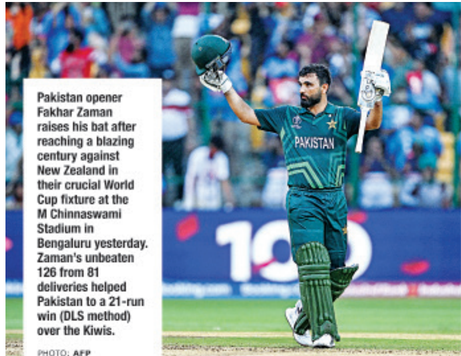
Pakistan opener Fakhar Zaman raises his bat after reaching a blazing century against New Zealand in their crucial World Cup fixture at the M Chinnaswami Stadium in Bengaluru yesterday. Zaman's unbeaten 126 from 81 deliveries helped Pakistan to a 21-run win (DLS method) over the Kiwis.