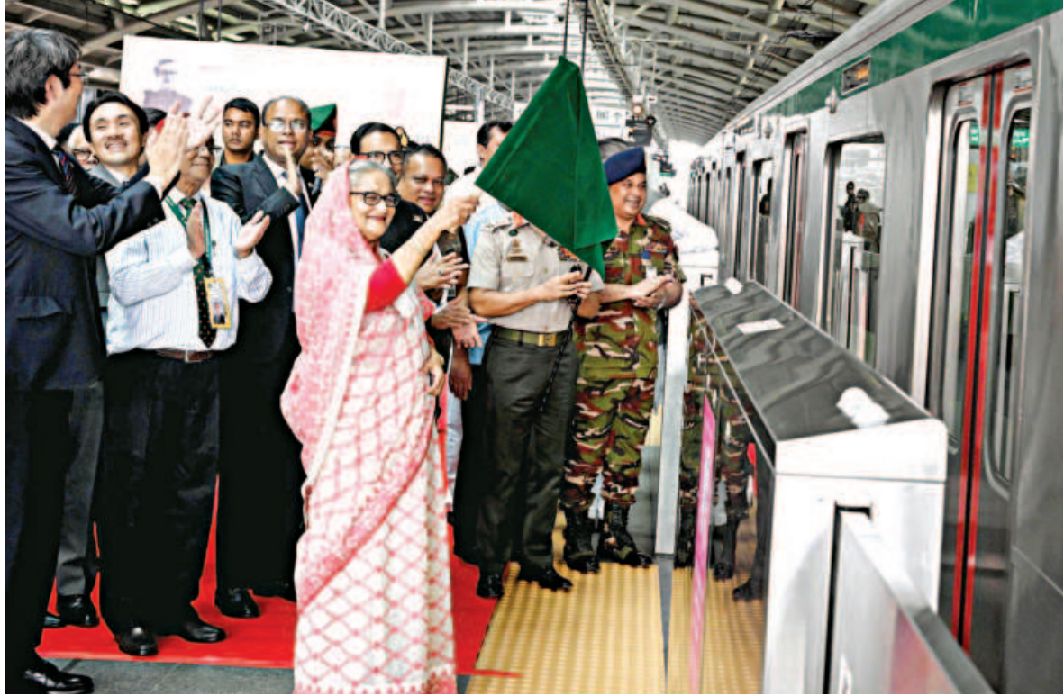
Prime Minister Sheikh Hasina flags off a train at the Agargaon metro station inaugurating the Agargaon-Motijheel section of the MRT Line-6 yesterday. From today, metro rail will be in limited operations from the Uttara North to Motijheel.