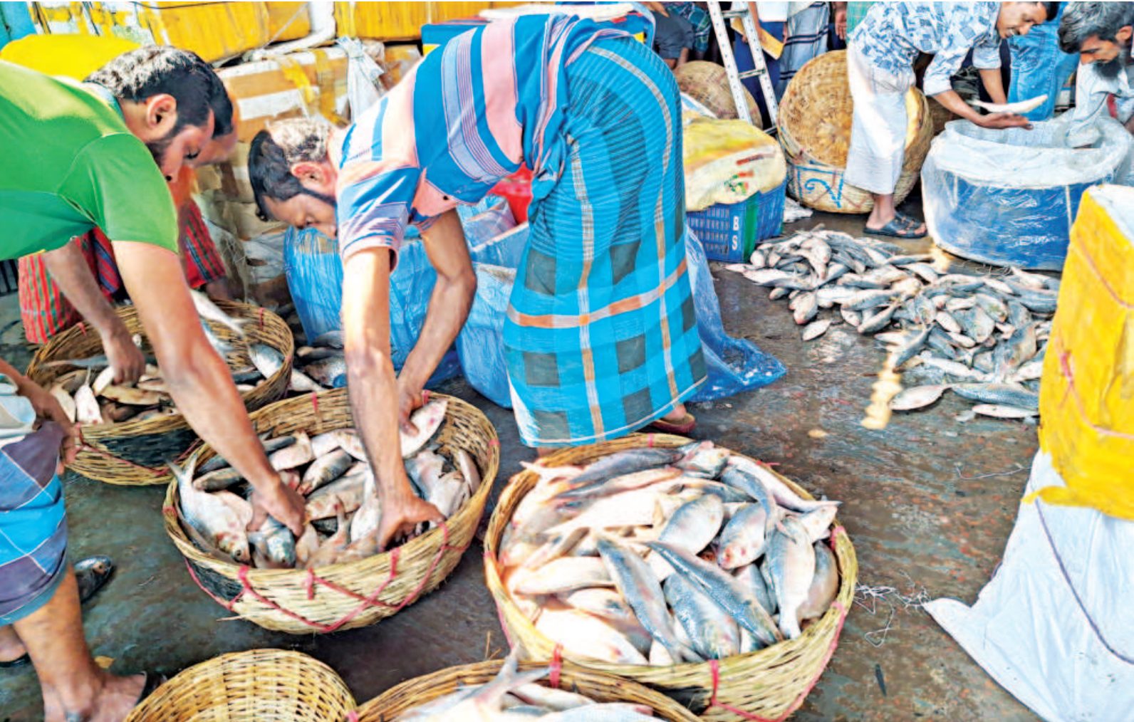
Traders sort out hilsa at the wholesale fish market on Barishal city’s Port Road yesterday morning, hours after a 22-day ban on fishing and trading of hilsa ended on Thursday. The national fish was sold for Tk 14,000 to Tk 55,000 per maund, depending on size and quality.