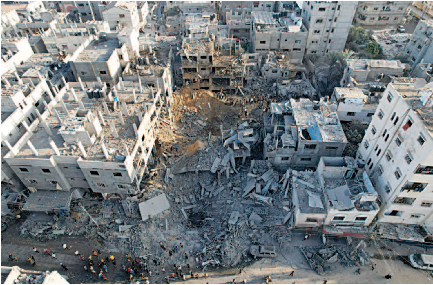
Palestinians gather at the site of Israeli strikes on houses in Maghazi, in the central Gaza Strip, yesterday.