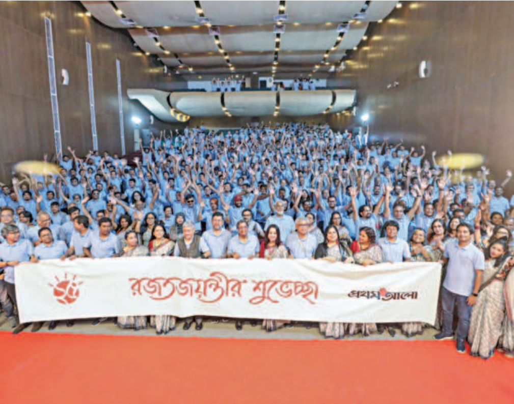
The Bangla daily Prothom Alo celebrated its 25th anniversary at Krishibid Institute of Bangladesh (KIB) in Dhaka yesterday. As part of the event, a cultural programme was also held.