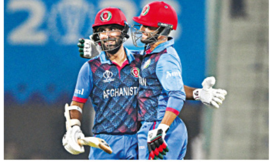
Afghanistan captain Hashmatullah Shahidi (L) embraces Azmatullah Omarzai after reaching his half-century on way to guiding his side to a seven-wicket victory against the Netherlands in their World Cup fixture in Lucknow yesterday.