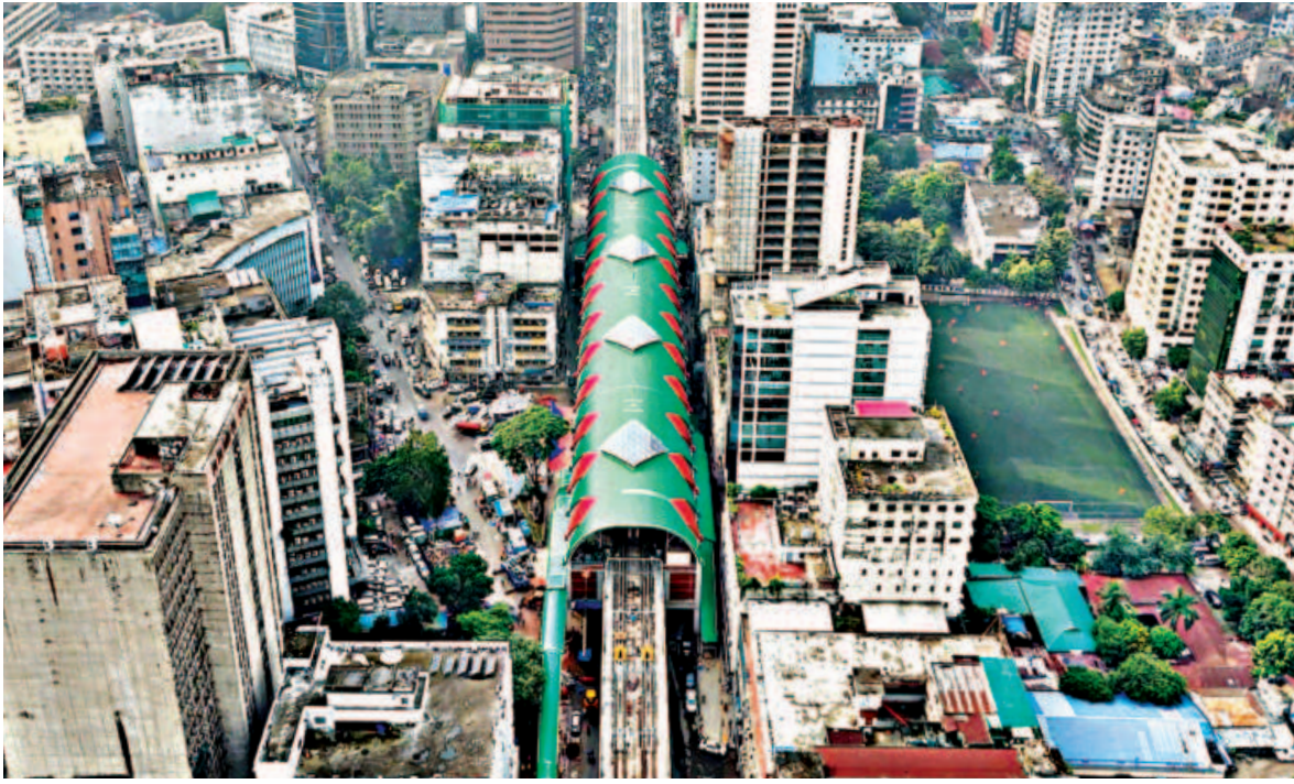
An aerial view of Motijheel metro rail station in the capital. Prime Minister Sheikh Hasina is set to inaugurate the Agargaon-Motijheel section of metro rail MRT Line-6 today. The photo was taken recently.