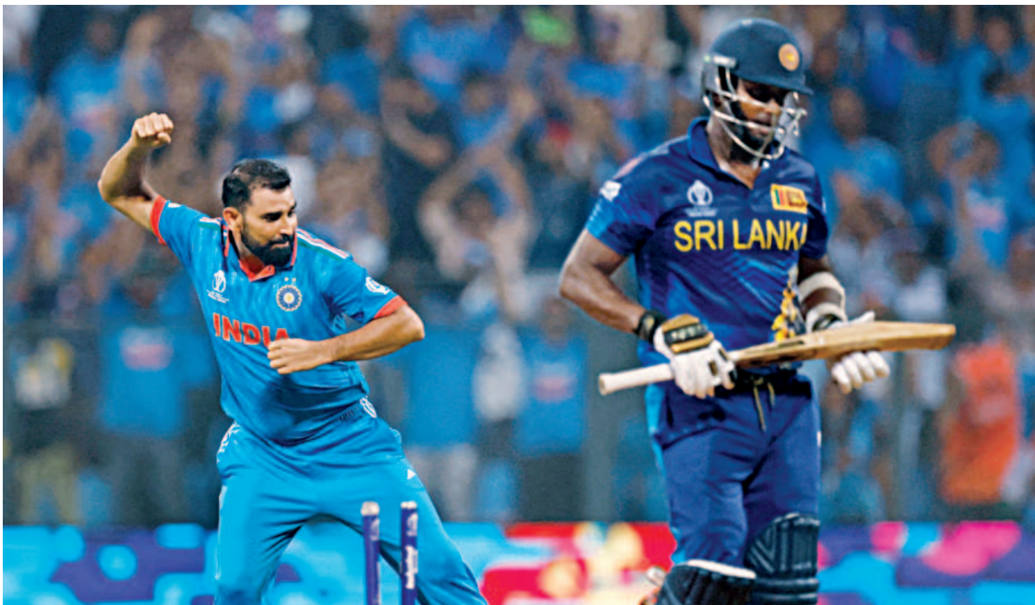
Mohammed Shami of India celebrates after dismissing Sri Lanka's Angelo Mathews in their seventh ICC World Cup match at Mumbai's Wankhede Stadium yesterday. Courtesy of a five-wicket haul, Shami is now India's all-time leading wicket-taker in the tournament, with 45 scalps.