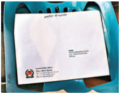
EC's invite to talks at BNP headquarters

The BNP and like-minded parties would not be sending anyone to the talks, sources said, adding that Islami Andolon Bangladesh, a major Islamist party, too would not join.