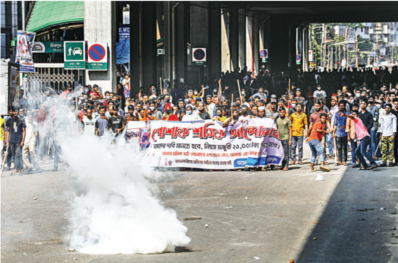
Garment workers stage demonstrations blocking a road in the capital's Mirpur-11 yesterday demanding their minimum monthly wages be fixed at Tk 23,000 and punishment of those who attacked their recent demos. Police fired tear gas and sound grenades to break up the protesters.