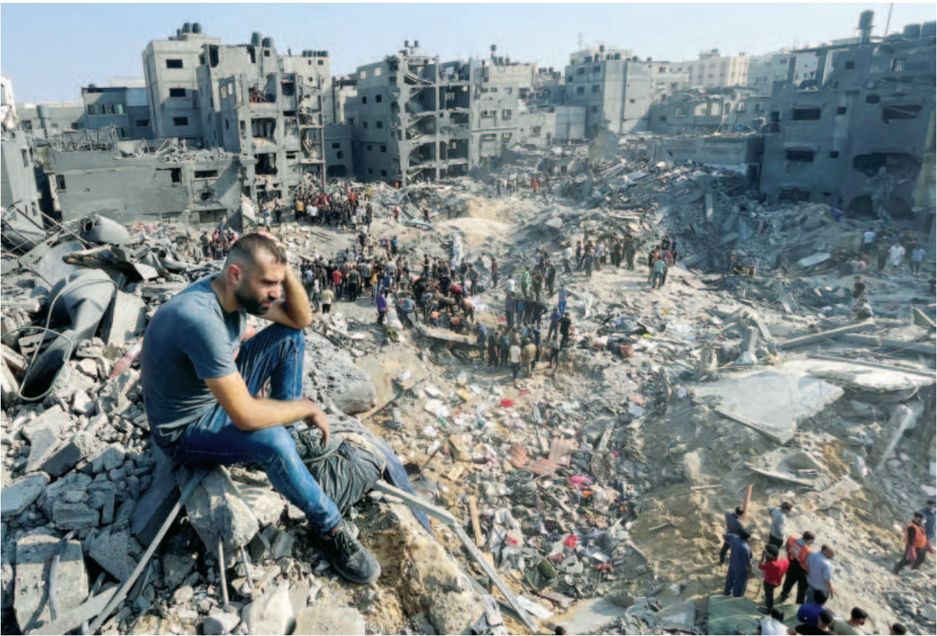
A man gestures as Palestinians search for casualties a day after Israeli strikes on houses in Jabalia refugee camp in the northern Gaza Strip yesterday.

"Our findings indicate that plastics in freshwater bodies may contribute to the transport of potential pathogens and antibiotic resistance genes," said lead author Vinko Zadjelovic of the University of Antofagasta in Chile. "This could have indirect but significant implications for human health," he told AFP. Antibiotic resistance is a growing public health threat. In 2019, infections related to antibiotic resistance are estimated to have killed 2.7 million people worldwide. By 2050 they are predicted to cause 10 million deaths worldwide, according to the study, published in the journal Microbiome.