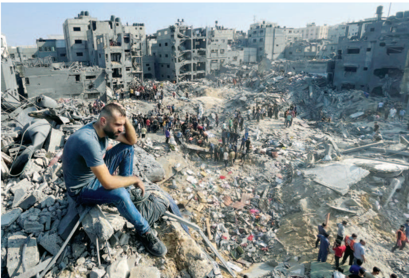
A man gestures as Palestinians search for casualties a day after Israeli strikes on houses in Jabalia refugee camp in the northern Gaza Strip yesterday.

The median line bisects the 180-kilometre (110-mile) waterway separating the island from China.