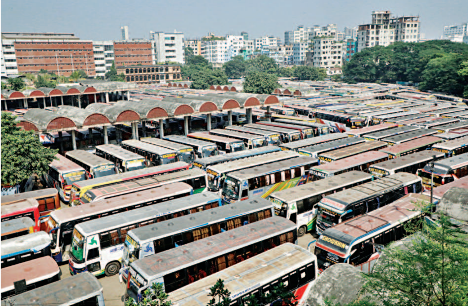
Buses lie idle at Mohakhali terminal yesterday. Many bus operators and workers are not ready to operate buses amid the ongoing blockade unless they get assurance about protection and compensation.