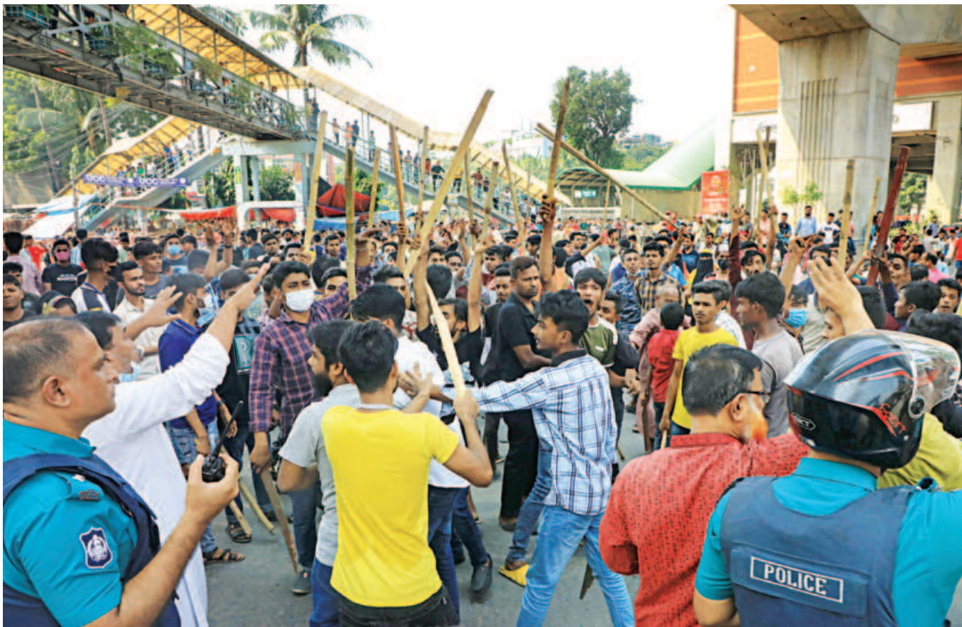
Carrying sticks, garment workers block the Mirpur-10 intersection in the capital yesterday demanding better wages and justice for Tuesday's attacks on their fellow workers. Police are seen trying to pacify the demonstrators. The protesters stayed at the busy intersection blocking traffic for several hours.