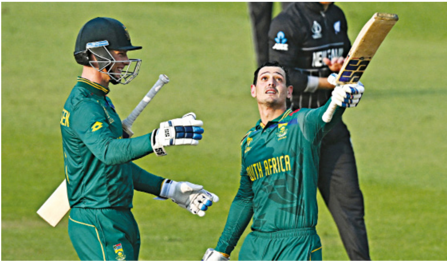
Quinton de Kock (R) celebrates with teammate Rassie van der Dussen after reaching a century against New Zealand – his fourth century in six matches in this World Cup – paving the way for a 190-run victory for South Africa at Pune's Maharashtra Cricket Association Stadium yesterday.