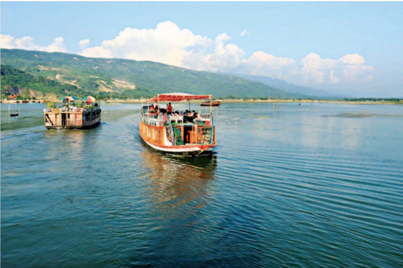
Two boats carrying tourists head for Niladri Lake, a popular tourist attraction in Sunamganj. Such boats designed specially for tourists take them on a daylong trip to the picturesque lake to give them a break from the busy urban life. The photo was taken recently.