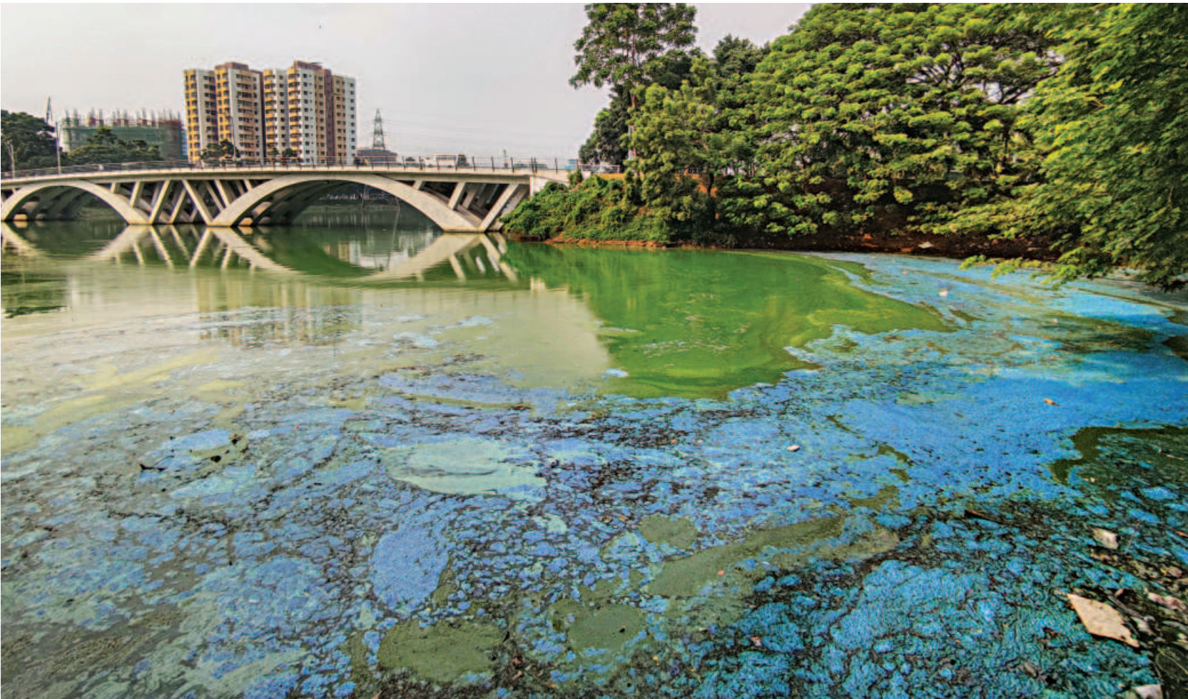
The water of Hatirheel has turned murky in Moghbazar area as sewage from homes and commercial buildings flows into it. The stagnant water has become an ideal breeding ground for mosquitoes too. The photo was taken yesterday.

BSS, Narayanganj Prime Minister Sheikh Hasina yesterday called upon the imams to work for maintaining peace so that everyone can practice their religions freely. “We want cooperation from you [alem, olama, and imam],” she said. The PM was addressing the National Imam Council and prize-giving ceremony-2023 as she opened 50 model mosques and Islamic cultural centres across the country. The religious affairs ministry organised SEE PAGE 6 COL 1