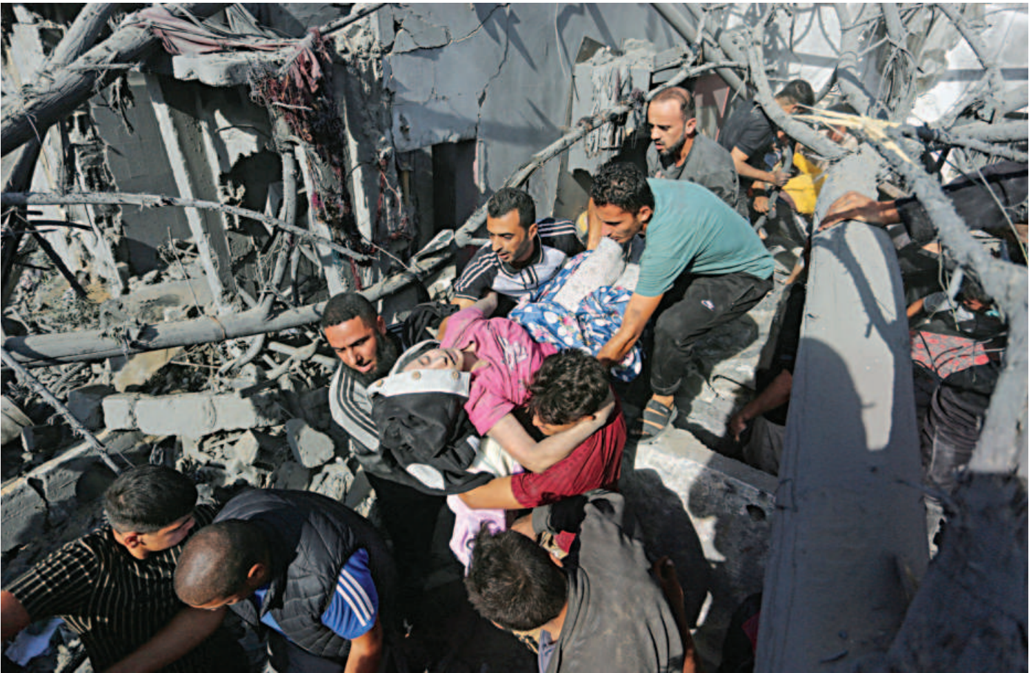
A Palestinian casualty is assisted at the site of an Israeli strike on a house in Rafah in the southern Gaza Strip yesterday. Israeli troops and tanks attacked Gaza’s main northern city from both sides yesterday, three days after they began a major ground offensive in the Palestinian enclave.

Says UN AFP, YANGON Thousands of people are feared to have been displaced by four days of fighting in northern Myanmar, including several hundred who reportedly fled to China, the United Nations said yesterday. On Friday, three powerful ethnic armed organisations attacked junta troops across a swathe of northern Shan state, home to a planned billion-dollar rail link, part of Beijing’s Belt and Road infrastructure project. The Ta’ang National Liberation Army, the Arakan Army and the Myanmar National Democratic Alliance Army have since said they have seized several military posts and key roads. The three groups have fought regularly with the military over autonomy and control of resources. “As of 30 October, over 6,200 individuals have reportedly been newly displaced” by the fighting, the UN Office for the Coordination of Humanitarian Affairs said in a statement.