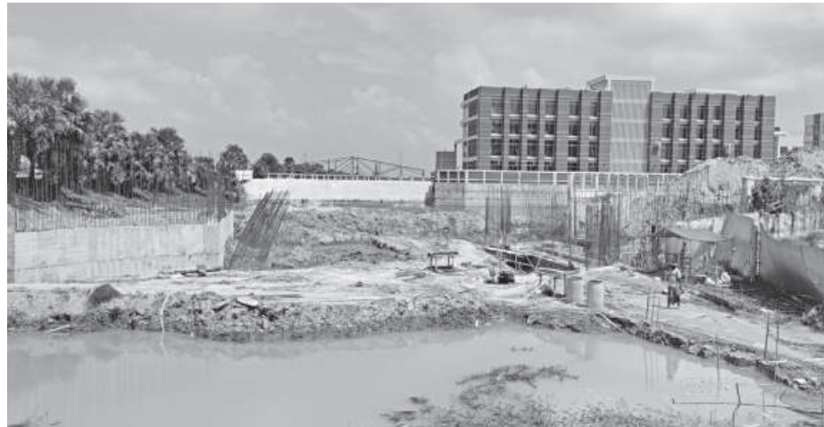
The various development projects around Natore's Chalan Beel is obstructing the natural flow of the waterbody, leading to frequent waterlogging in its neighbouring areas. Locals and experts alleged that the projects are poorly planned and will harm the ecological balance of this natural freshwater reservoir.