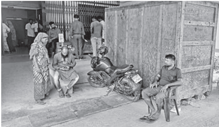
The radiotherapy machine remains packed in a box for over a decade in front of the radiotherapy and oncology department at the Khulna Medical College Hospital, causing cancer patients to suffer.