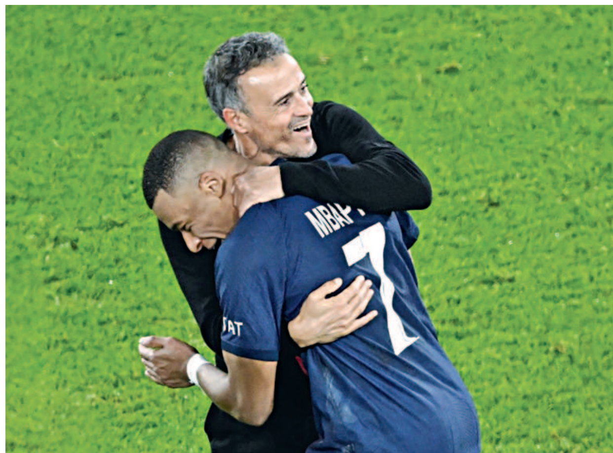
PSG forward Kylian Mbappe's brilliant strike inspired the French giants to a 3-0 win over AC Milan at the Parc des Princes on Wednesday, after which the Parisians moved to the top of Group F standings with six points in three matches. His 13th goal in as many matches in all competitions this season has made PSG's qualification in the UCL's Round of 16 easier following a 4-1 loss at Newcastle in their previous fixture, taking some pressure off coach Luis Enrique.

"Apart from our AFC Cup commitments, we also provide the most players to the national football team who will face tough contests too this next year with the World Cup qualifiers to be played," the Spaniard added.