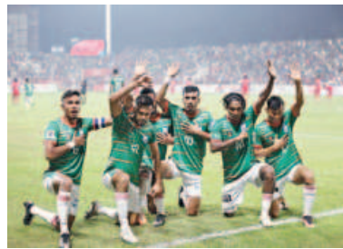
Bangladesh climbed six spots to reach 183 in the FIFA rankings - their best standing since July 2019 when they ranked 182.

Against Afghanistan, a team that's still 29 spots ahead of