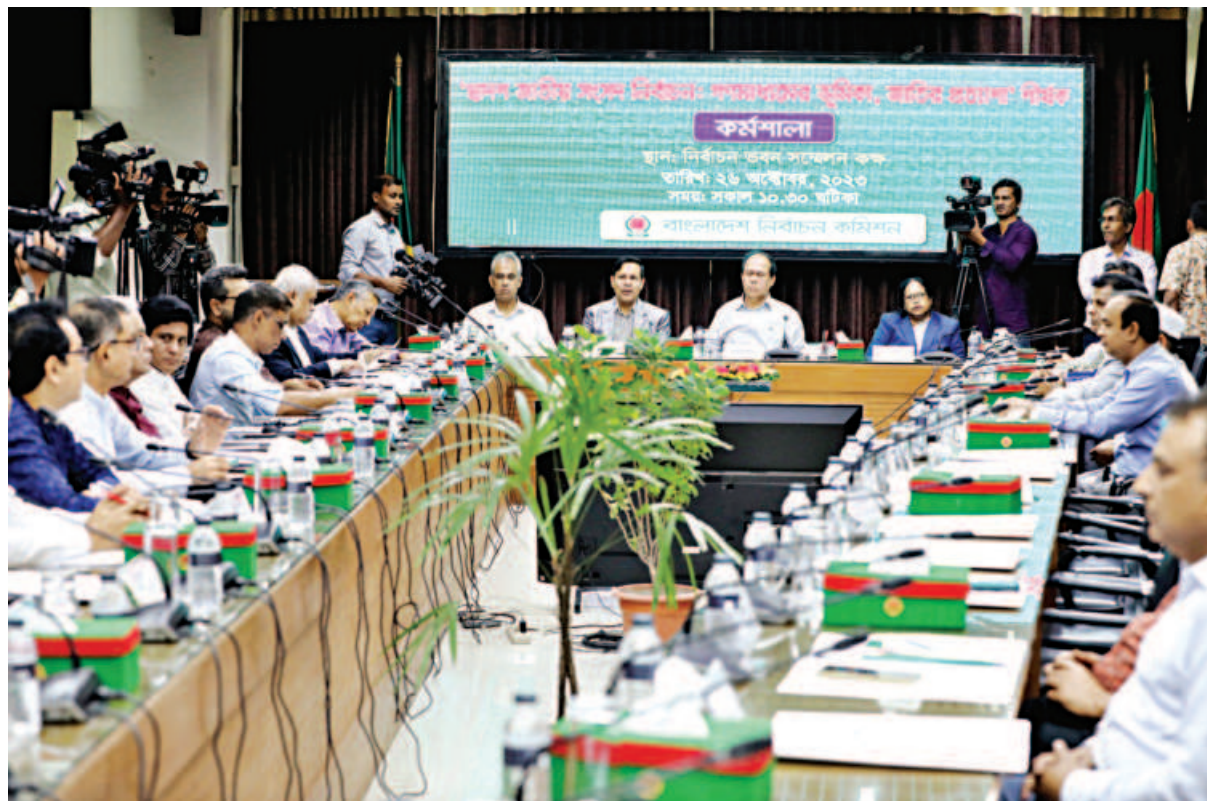
Editors and senior journalists of various newspapers and television channels at a workshop titled "12th parliamentary polls: role of media and expectation of the nation", organised by the Election Commission at its office in the capital yesterday.