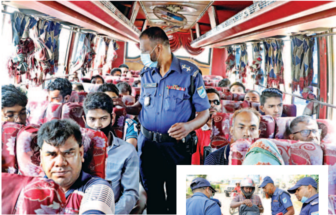
Police have set up checkpoints on roads leading to Dhaka ahead of the Awami League and BNP rallies on October 28. The photos were taken at Aminbazar on Dhaka-Aricha highway yesterday.

After the ordinance is issued, there will be no scope for any university to take admission tests outside of it.