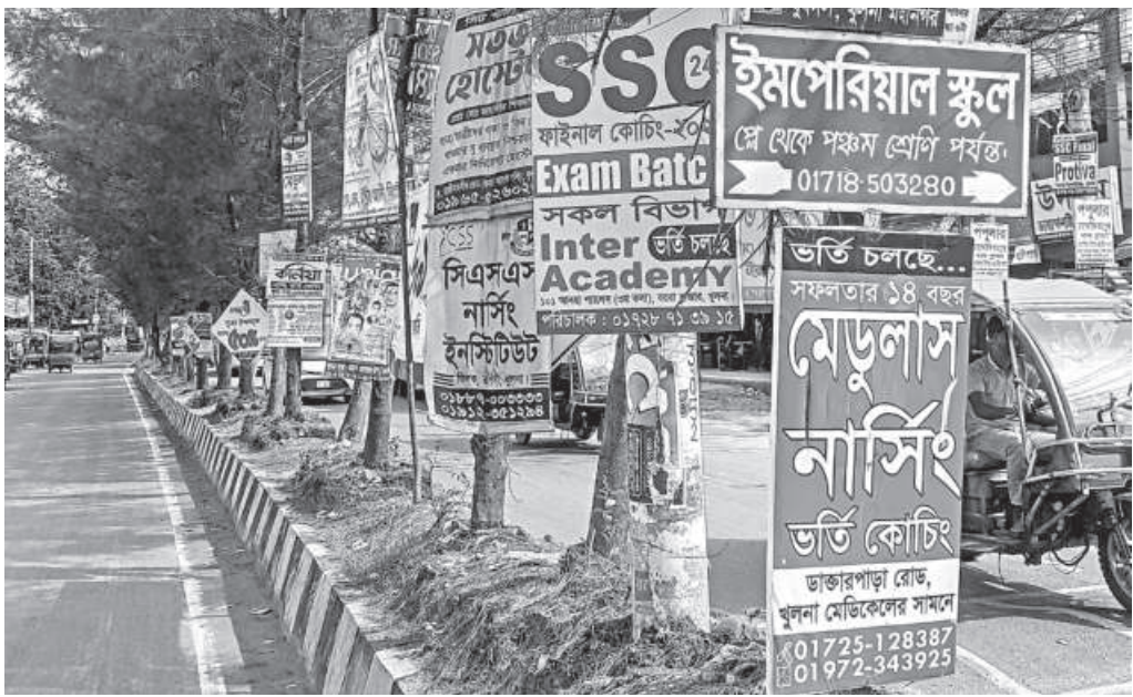
Jhau trees that were once planted on medians to enhance the beauty of Sonadanga-Notun Rasta road in Khulna city now serve as notice boards where local businesses, especially coaching centres, advertise their products and services. The photo was taken near the Khulna Medical College Hospital yesterday.

"Whereas, the patient is disoriented with cold clammy skin, unrecordable blood pressure and pulse, and is unable to urinate when under decompensated shock. Patients with these symptoms die within a short time despite being under treatment," he mentioned.