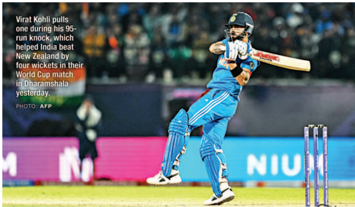
Virat Kohli pulls one during his 95-run knock, which helped India beat New Zealand by four wickets in their World Cup match in Dharamshala yesterday.