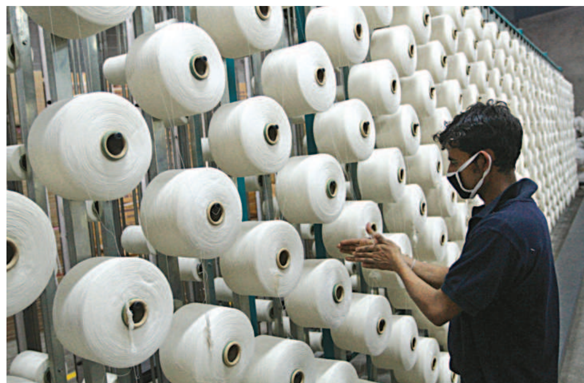
Yarn stockpiling is again taking place at the mills as many garment makers are not collecting their orders despite previously having agreed upon contracts.