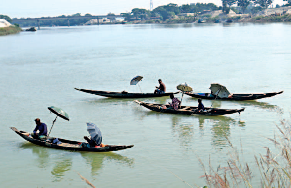
As the dawn breaks, fishers set off to the Changerkhal river in Sylhet Sadar with their hooks and nets. After spending hours in the waters, they return ashore with their daily catch and sell those at local markets. The photo was taken recently.