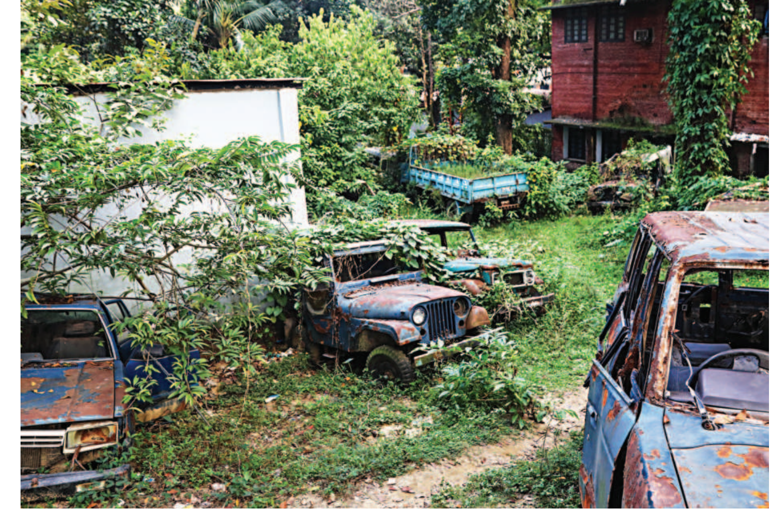
Weeds have started sprouting from these unusable cars, which have been left to rot at the Eastern Railway headquarters in the port city's CRB area. Once used for official purposes, the railway authority dumped the vehicles after they broke down, without taking proper steps to repair or sell them for parts.

At least 3,785 people, including 1,524 children and 1,000 women, have been killed in the Gaza Strip since Israel began bombarding the coastal enclave, the Hamas-controlled health ministry said yesterday.