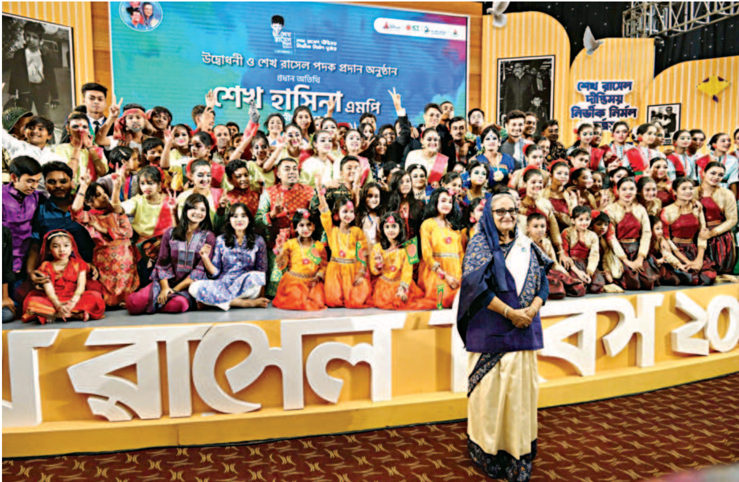
Prime Minister Sheikh Hasina along with a group of children at an event marking the 60th birth anniversary of Father of the Nation Bangabandhu Sheikh Mujibur Rahman's youngest son Sheikh Russel. The programme was held at Bangabandhu International Conference Centre.