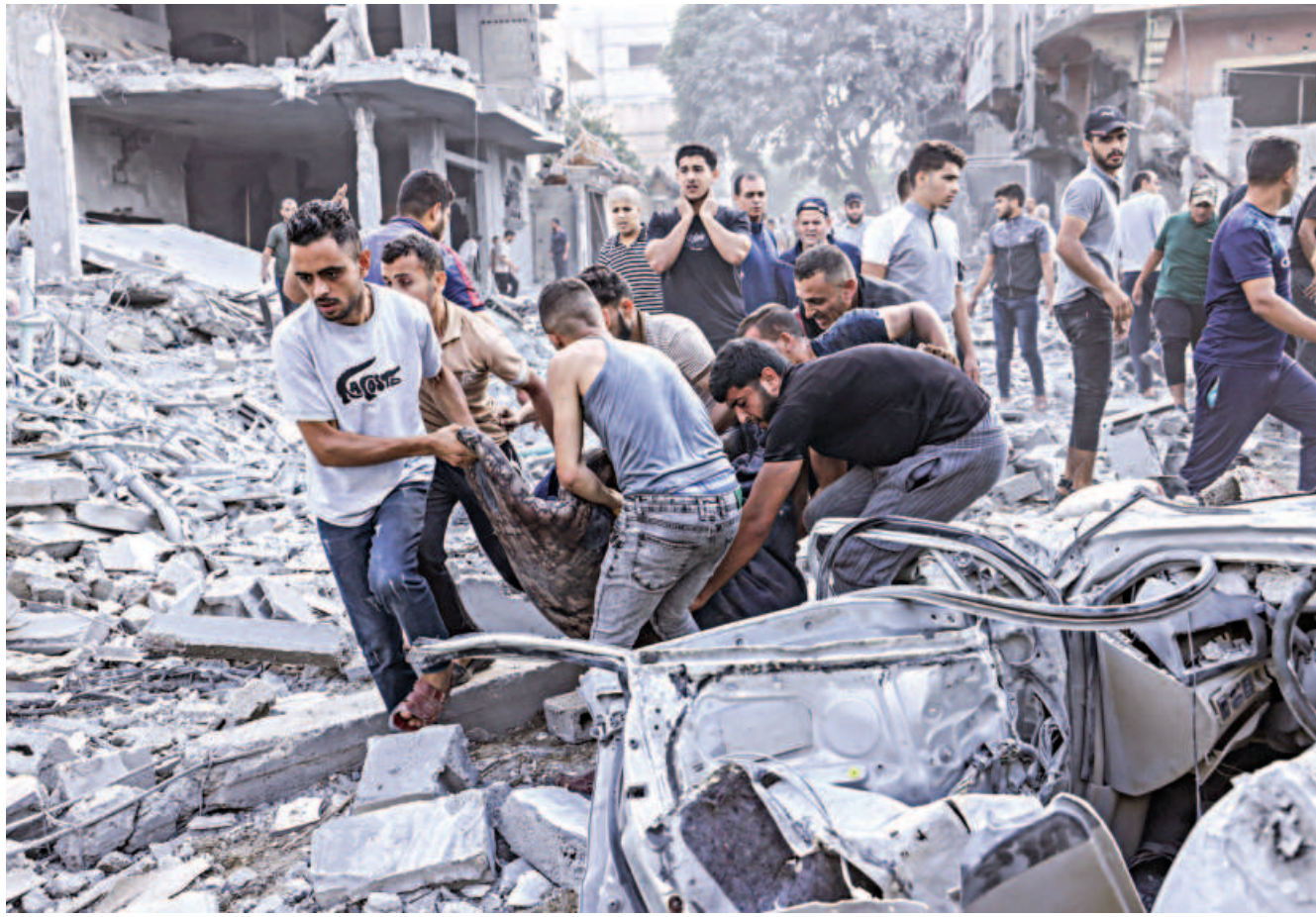
Palestinians evacuate a victim following an Israeli airstrike on Rafah, in the southern Gaza Strip yesterday.

Indonesian Publishers Association said organisers' decision to "take sides and give Israel a platform" has undermined the ideals of dialogue and efforts to build mutual understanding.