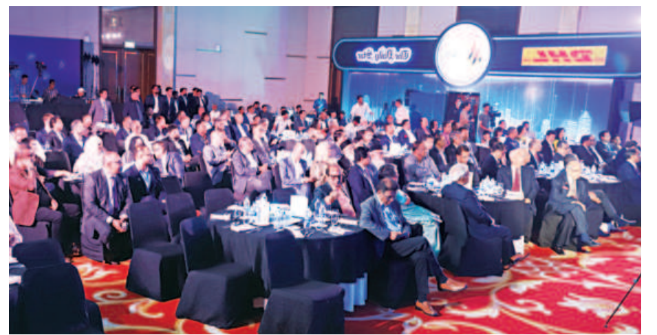
A section of the guests at the 21st DHL-Star Bangladesh Business Awards ceremony at Sheraton Dhaka last night.