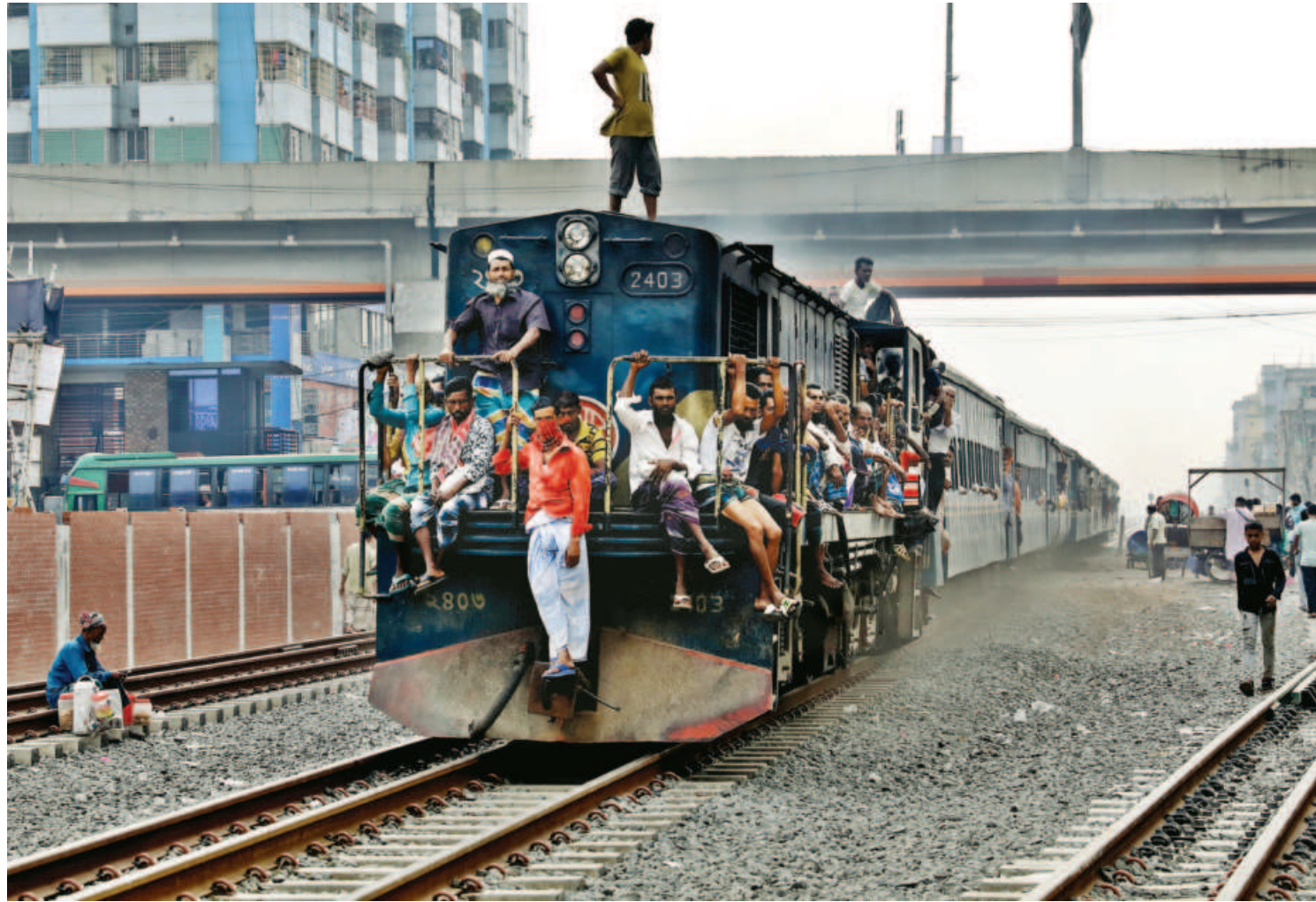
People get on a train's locomotive while travelling on the Narayanganj-Dhaka route, ignoring risks. What's more alarming, a person is standing on the railway coupler while another on the roof. The photo was taken in the capital's Jurain area yesterday.