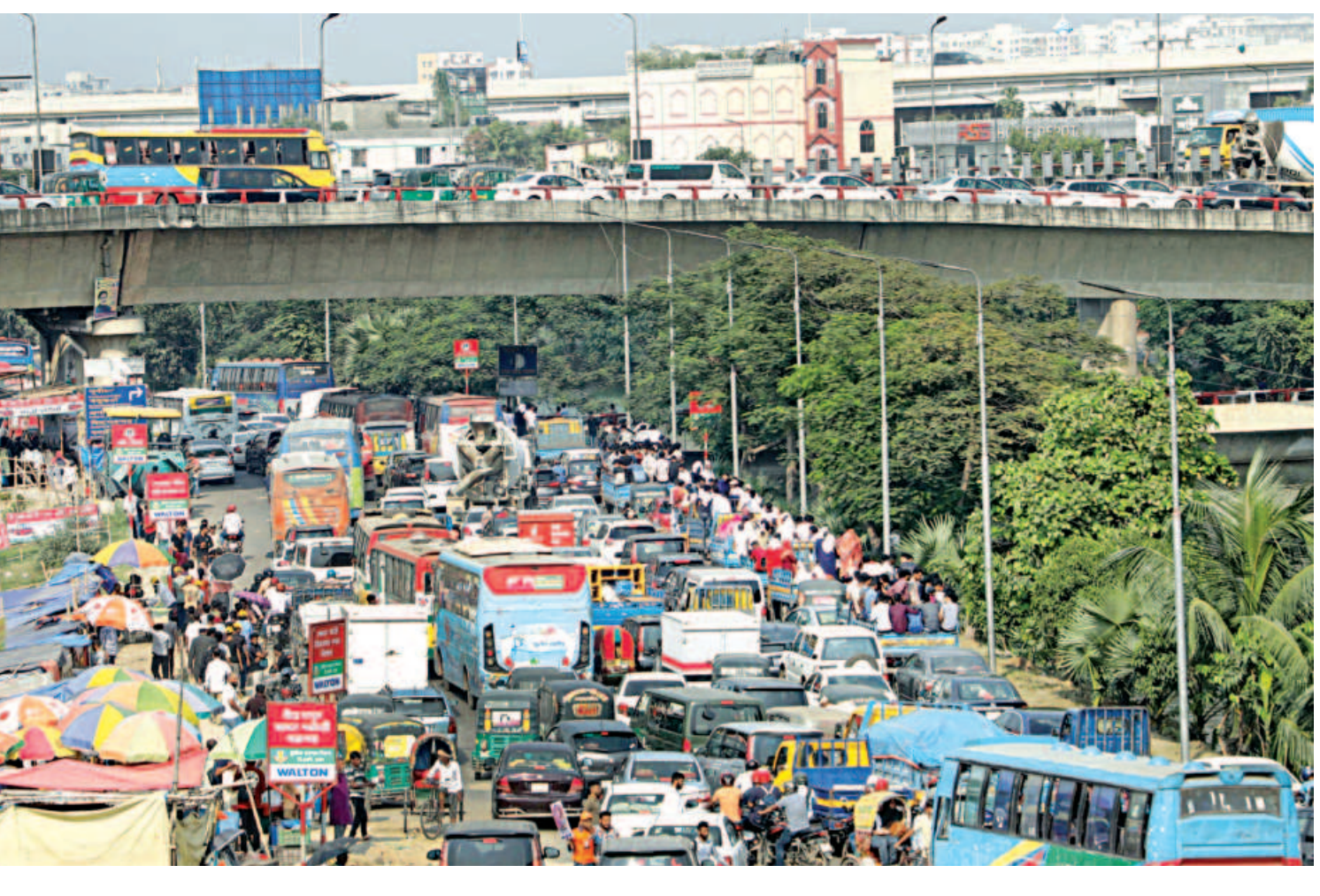
Bumper-to-bumper traffic on the ground and on the flyover in Kuril Biswa Road area yesterday afternoon. The tailback went up to the 300 Feet Road as well. Many city dwellers were stuck in jams for hours in the capital due to multiple political events.

When appointing them, he imposed a condition SEE PAGE 6 COL 3