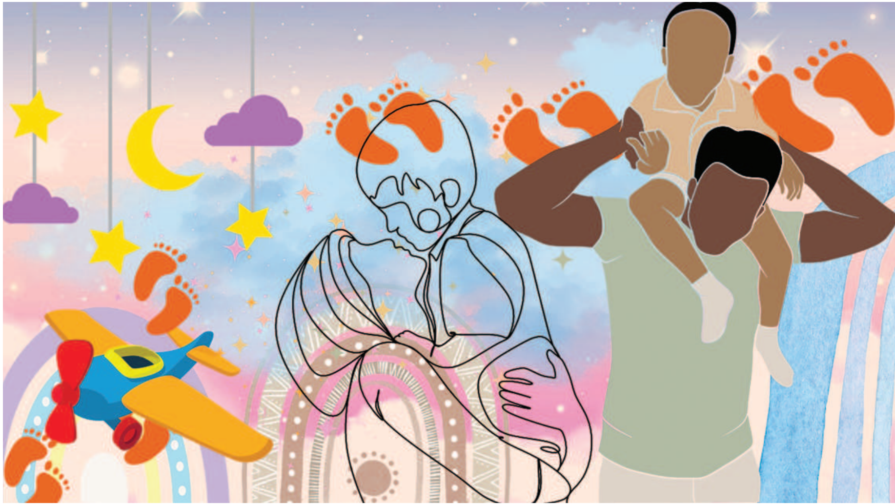
DESIGN: MAISHA SYEDA