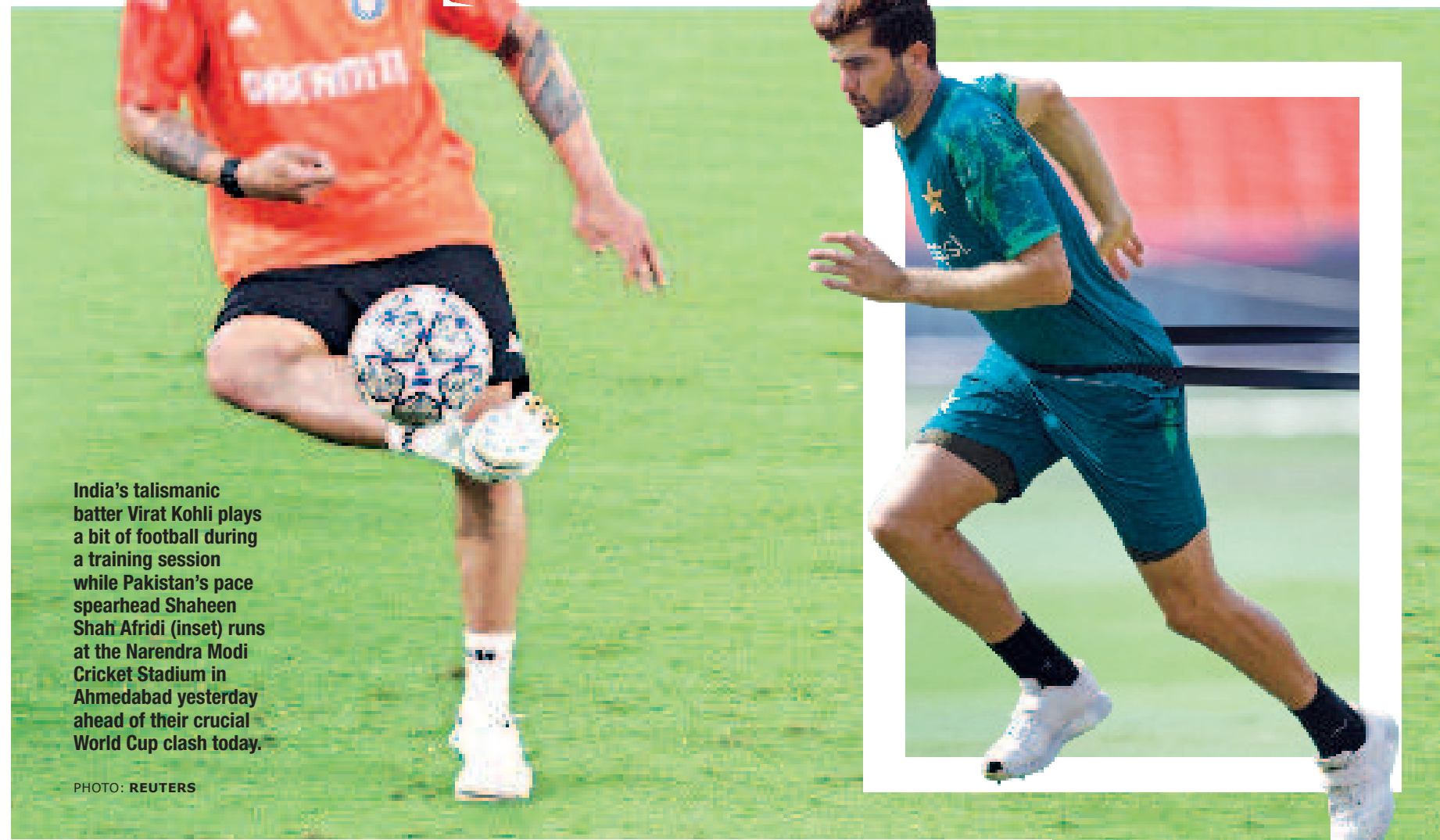
India's talismanic batter Virat Kohli plays a bit of football during a training session while Pakistan's pace spearhead Shaheen Shah Afridi (inset) runs at the Narendra Modi Cricket Stadium in Ahmedabad yesterday ahead of their crucial World Cup clash today.

Live from 10:00 pm Denmark vs Kazakhstan Live from 12:45 am (Sunday) SONY SPORTS 1 Italy vs Malta Live from 12:45 am (Sunday)