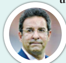
Pakistan legend Wasim Akram

"We played seven games and our neighbouring country reminds us every second day about the 7-0. Frankly speaking, I can't single out one reason for the losing streak."