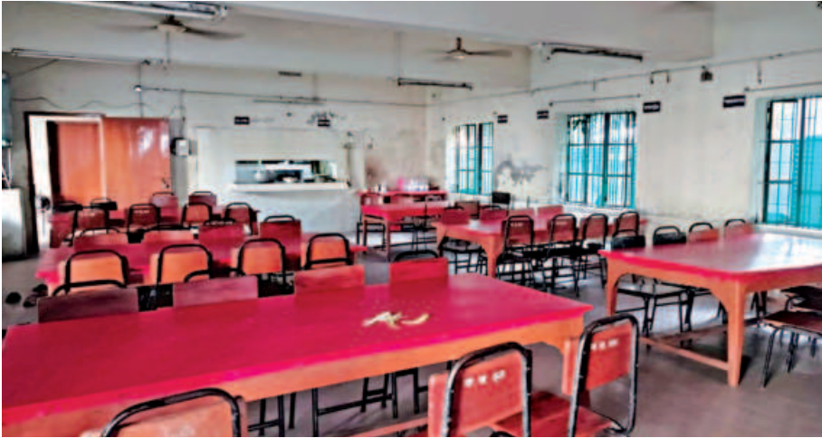
Canteen of Kabi Jasimuddin Hall of DU.