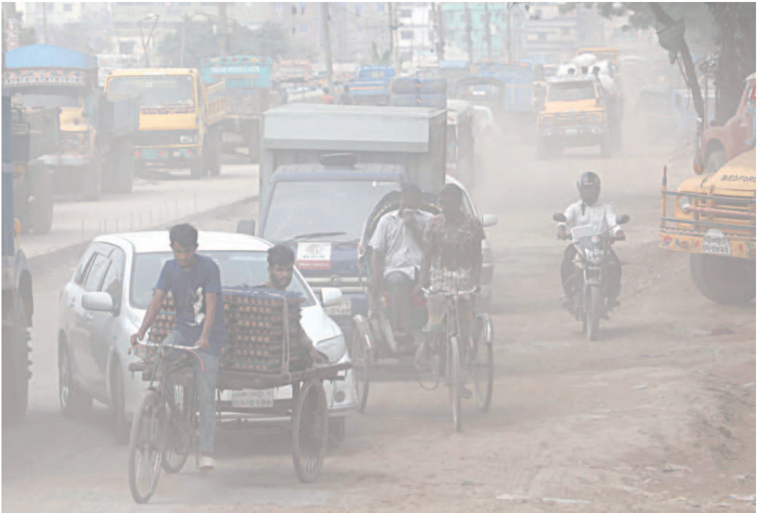
DUSTY DHAKA... It may look like a foggy day but it's actually dust in the air at the capital's Gabtoli-Sadarghat-Beribadh road. Ongoing construction works and digging of roads for installing utility ducts have turned the area into a dust bowl. Besides, heavy vehicles that carry construction materials often drop dirt and sand on the road, contributing to air pollution.