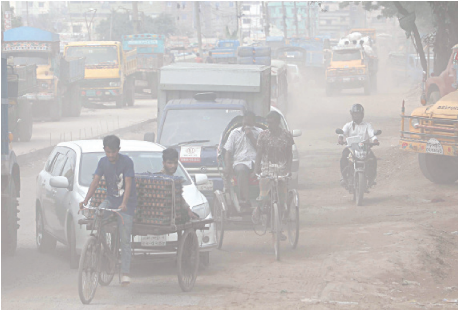
DUSTY DHAKA... It may look like a foggy day but it's actually dust in the air at the capital's Gabtoli-Sadarghat-Beribadh road. Ongoing construction works and digging of roads for installing utility ducts have turned the area into a dust bowl. Besides, heavy vehicles that carry construction materials often drop dirt and sand on the road, contributing to air pollution.