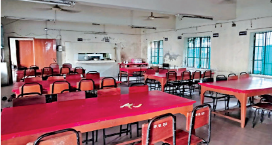
Canteen of Kabi Jasimuddin Hall of DU.