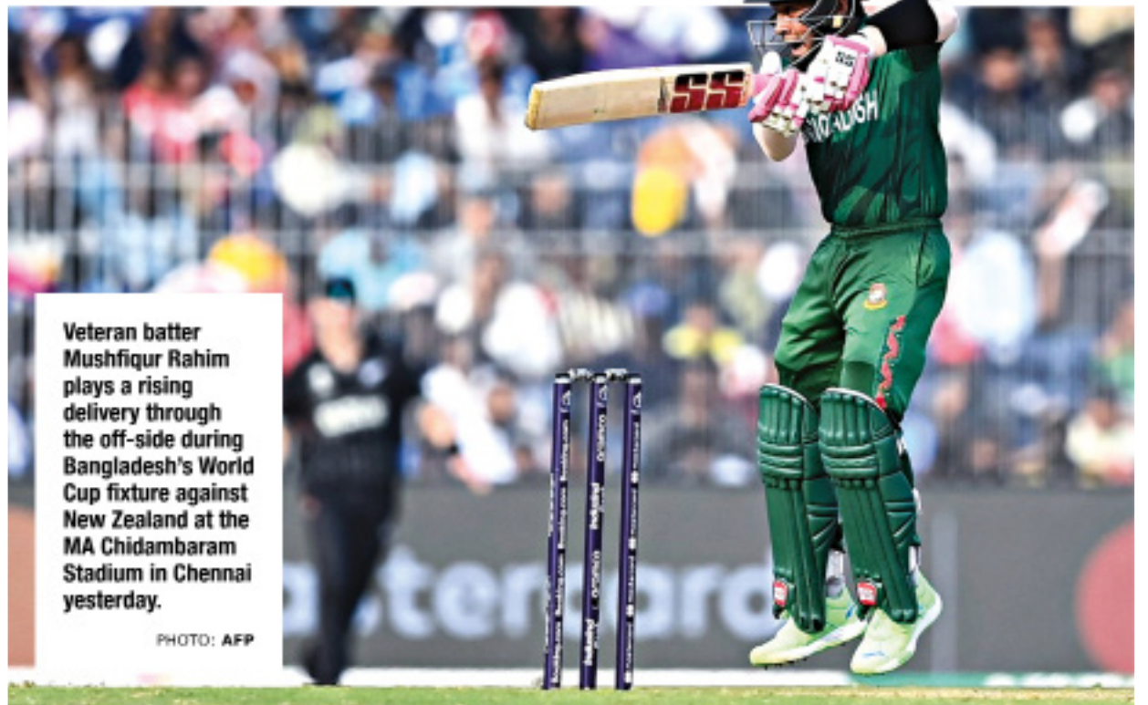
Veteran batter Mushfiqur Rahim plays a rising delivery through the off-side during Bangladesh's World Cup fixture against New Zealand at the MA Chidambaram Stadium in Chennai yesterday.