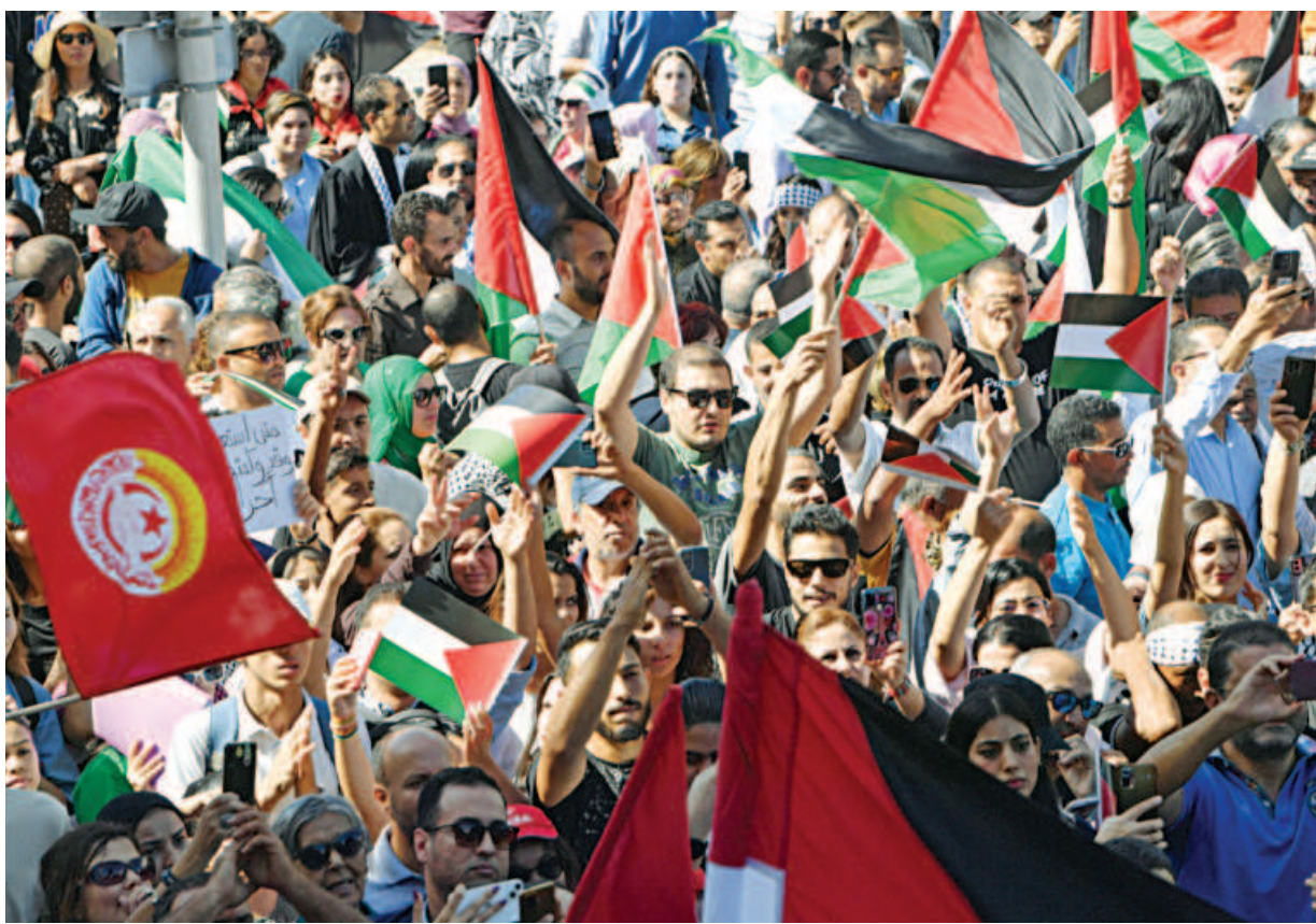
Protesters lift Palestinian and Tunisian flags and chant slogans during an anti-Israel demonstration in Tunis, Tunisia yesterday.

President Putin is wanted by the court over the deportation of Ukrainian children. Its ruling requires members of the ICC, which does not include Kyrgyzstan, to make the arrest if he sets foot on their territory.