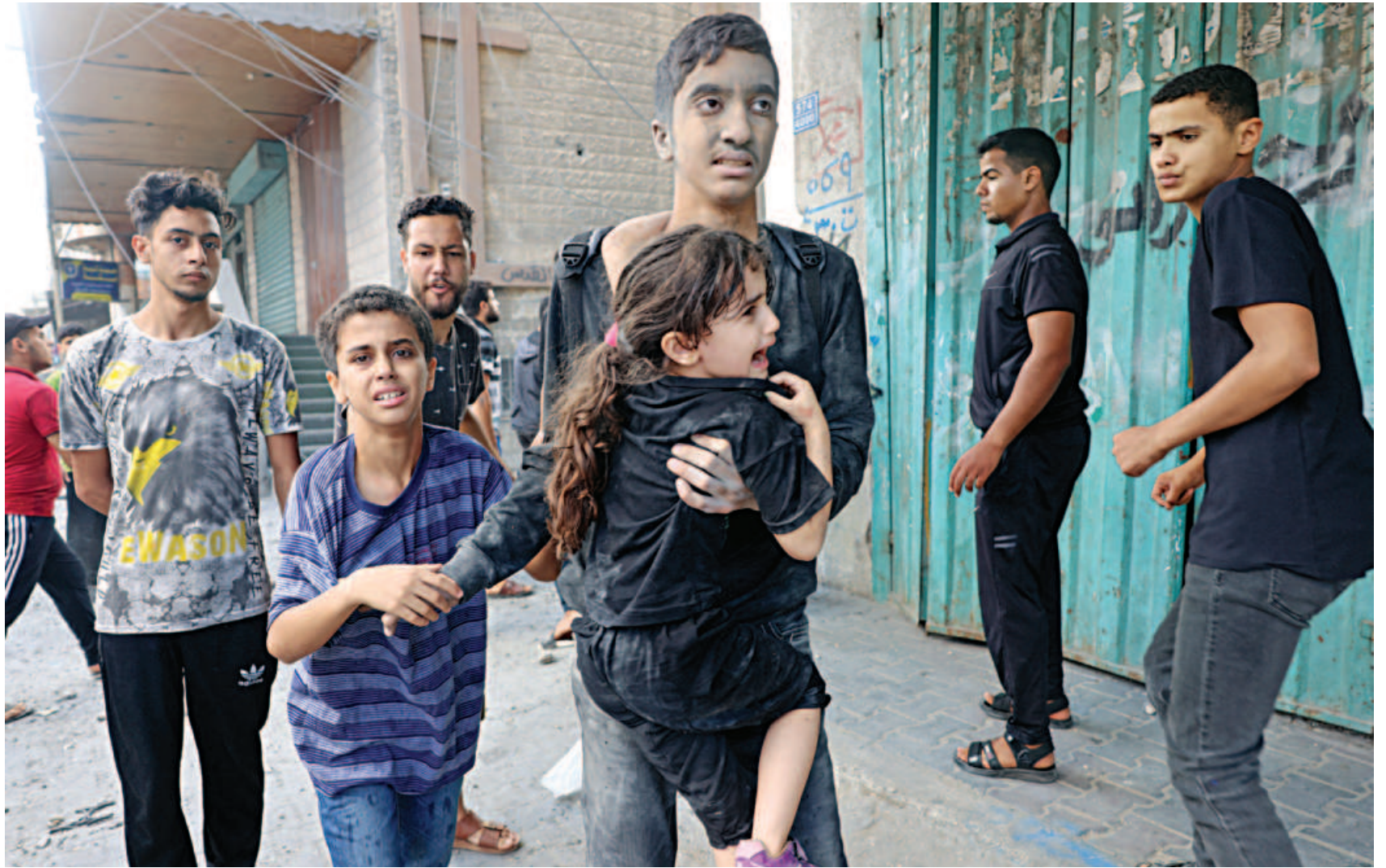
A young man carries an injured girl following an Israeli strike, as battles between Israel and the Hamas continue for the sixth consecutive day in Rafah, in the southern Gaza Strip yesterday. Story on page 12.