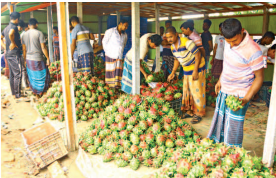
Buyers and sellers pass busy time at Gourinathpur wholesale market in Jhenidah's Moheshpur upazila.

Mentionable, dragon was cultivated in only 203 hectares of land in 2022, compared to 151 hectares the previous year. Farmers and traders said dragon are selling for Tk 180 to Tk 200, depending on its quality, at Moheshpur wholesale market. Dragon fruits worth nearly Tk 1 crore are being sold at the wholesale market every day, traders claimed. Farmer Ashadul Islam said earlier he used to cultivate different seasonal crops on two to three bighas land, but now he is cultivating dragon fruits on five to six bighas as it is much profitable compared to other crops. Another grower Mohiuddin Mondol said he is cultivating dragon fruits on eight to ten bighas for the last couple of years and earning a profit of Tk 10 to Tk 12 lakh every year. Shahinur Rahman, one of the vendors at Moheshpur market, said farmers from all the six upazilas in Jhenidah and adjoining areas of Jashore bring their produces at the wholesale market for sale. Another trader Dablu Hossain said he purchase about a hundred maunds of dragon fruits every day and send those to different districts across the country.