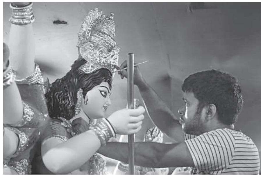
An artisan puts the final touches on an idol in the port city's Sadarghat area yesterday.