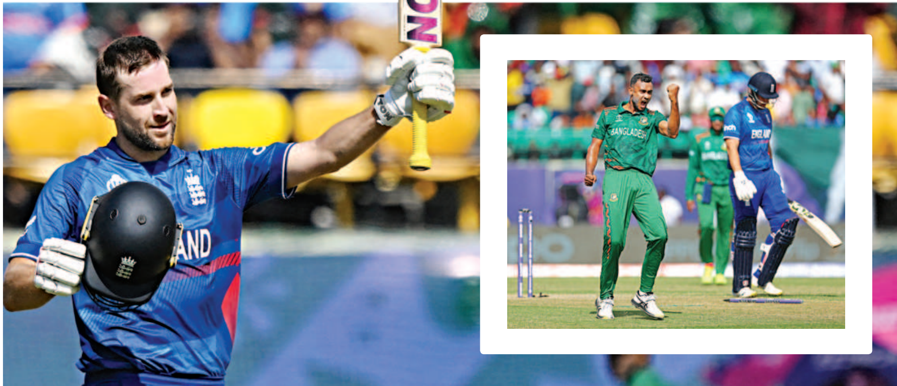
Pacer Shoriful Islam showcased his death-bowling skills to bag three late wickets but only after opener Dawid Malan took apart the Bangladesh bowling attack during his 107-ball 140 in Dharamshala yesterday, paving the way for a 137-run win for England in their second ICC World Cup match.