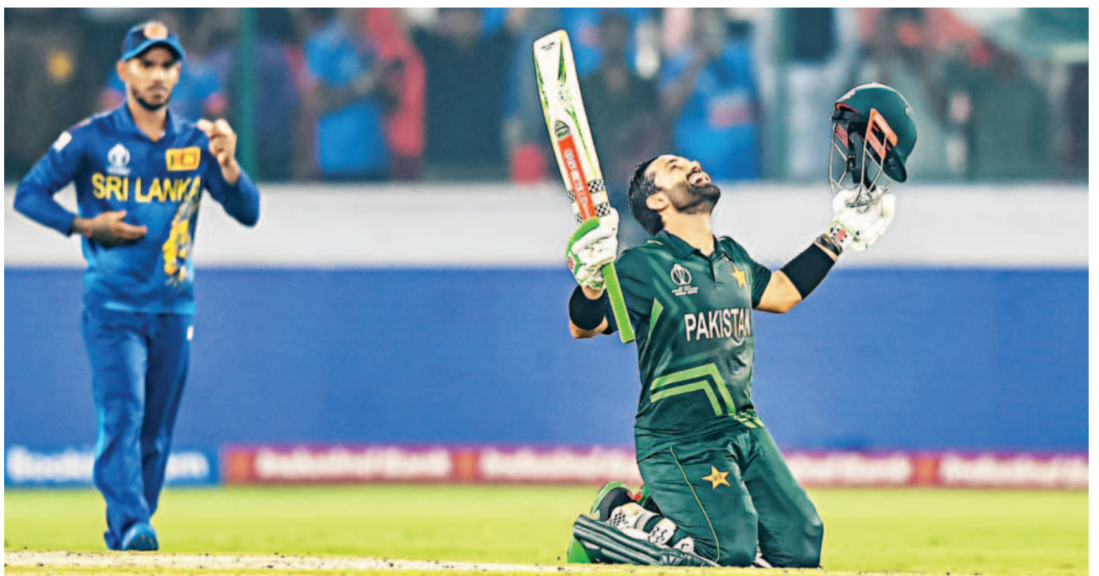
Pakistan batter Mohammad Rizwan looks to the heavens to celebrate his team's victory against Sri Lanka in their ICC ODI World Cup fixture at the Rajiv Gandhi International Stadium in Hyderabad yesterday. Chasing a daunting 345 after Kusal Mendis and Sadeera Samarawickrama smashed tons to put Sri Lanka in a commanding position, the 1992 champions got over the line in 48.2 overs thanks to Rizwan's 131 not out and Abdullah Shafique's 113. Rizwan was hit on his face and battled cramps after getting into the eighties but soldiered on for his third century, before guiding them home in style.