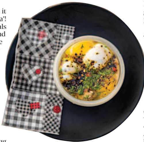
5 to Tk 7," said Sarwar Hossain Sohel, a grocer in Uttara.

Eggs are not only a staple source of nutrition in our diet but also an all-important ingredient in the kitchen. There are so many everyday recipes that need at least an egg to bind.