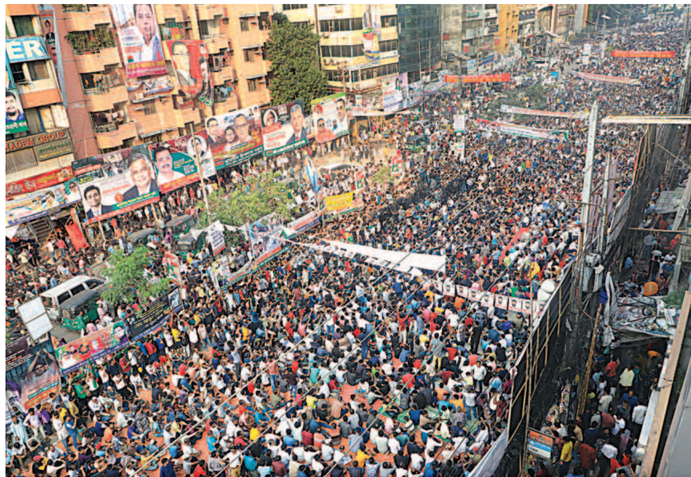
Thousands of BNP activists and supporters gathered near the BNP office in the capital's Nayapaltn yesterday during the party's rally, demanding the release of its chief Khaleda Zia to send her abroad for better treatment. Story on Page 3.

The fare proposal is now pending with the railways ministry for approval.