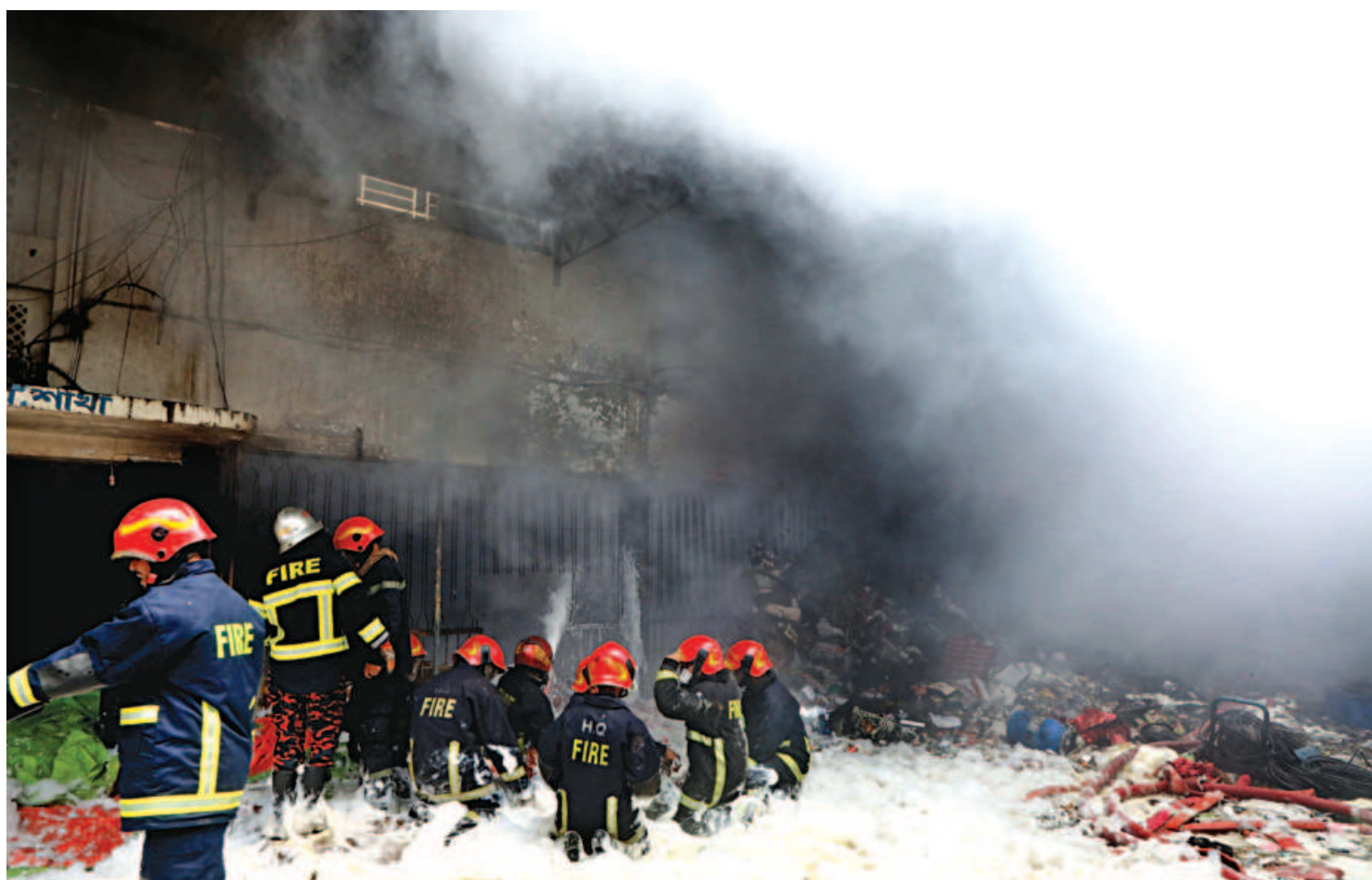
Firefighters battling a fire that broke out at the SA Paribahan head office's parcel delivery depot in the capital's Kakrail yesterday around 10:10am. The blaze came under control within 45 minutes and was fully doused around 2:30pm.

On August 20, Road Transport and Bridges Minister Obaidul Quader told reporters that Prime Minister Sheikh Hasina would inaugurate the Agargaon-Motijheel section of the metro rail on October 20.