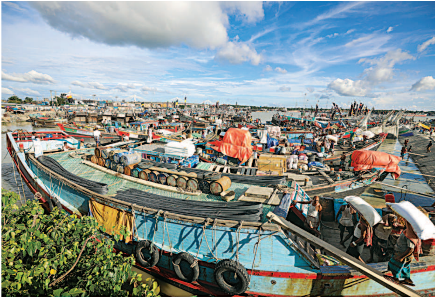
Rows of boats in Khatunganj, Chattogram, are being loaded with goods and supplies meant for Hatiya, Maheshkhali and other islands. Shipping to the islands is almost entirely dependent on these boats.