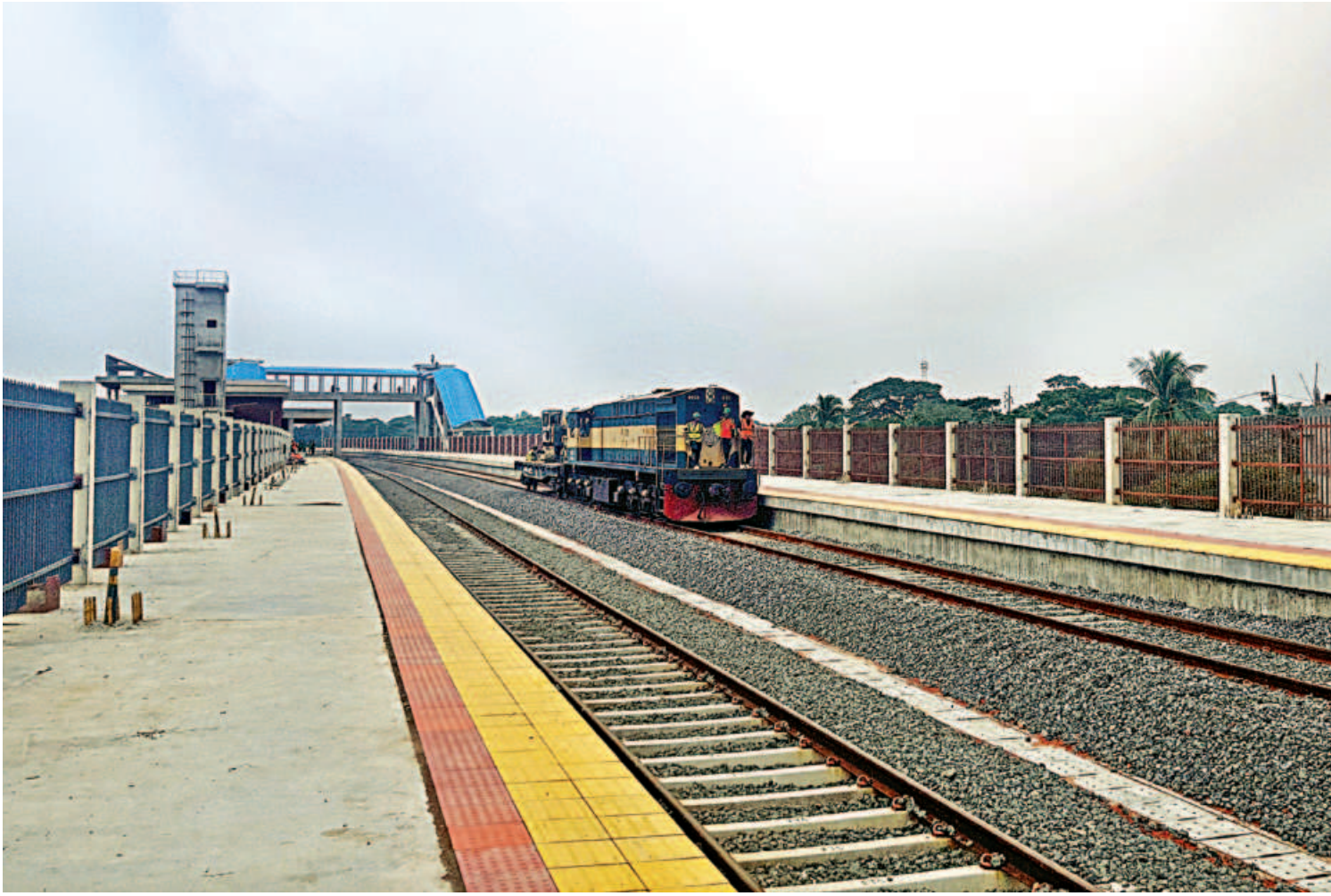
A locomotive goes past Sreenagar Railway Station during a trial run. Today, Prime Minister Sheikh Hasina is set to inaugurate railway link between Dhaka and Faridpur's Bhanga through Padma Bridge.